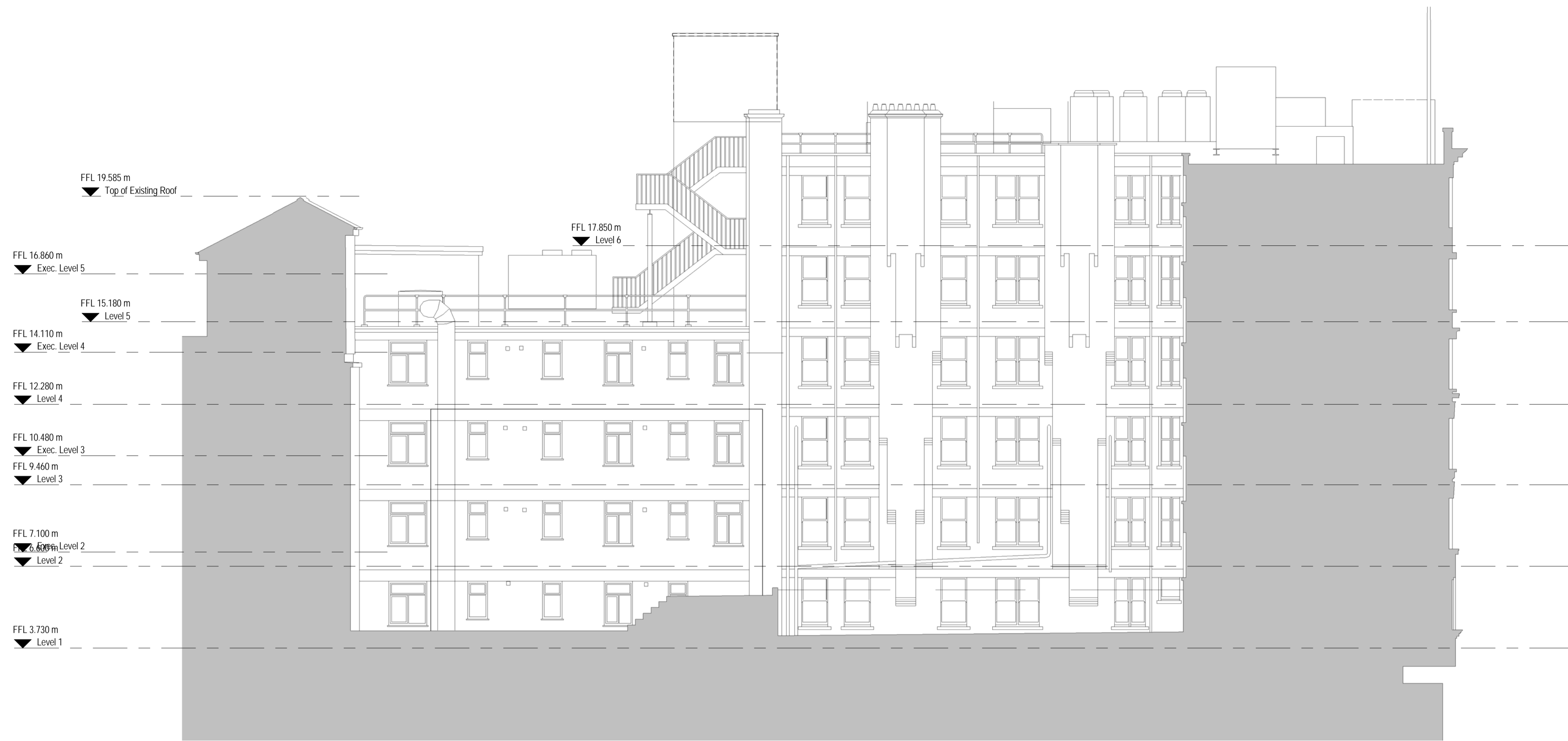
1 West Block 2 as existing 1 : 100