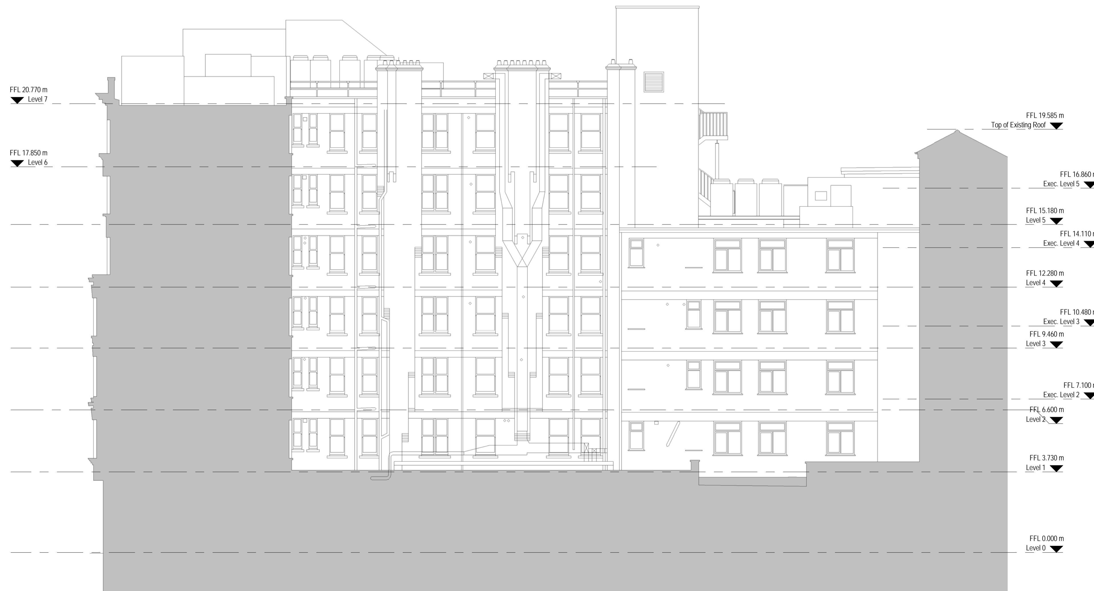
2 East Block 2 as existing 1 : 100