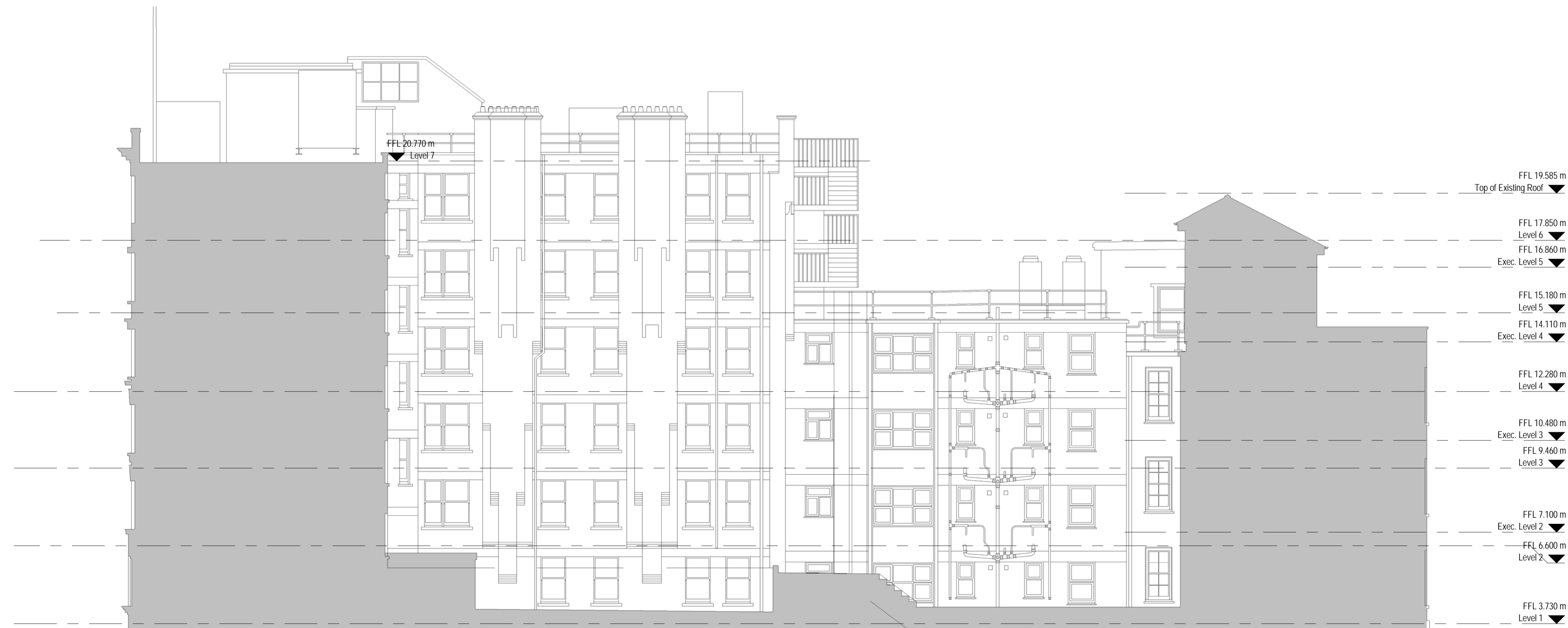
1 East Block 1 as existing 1 : 100