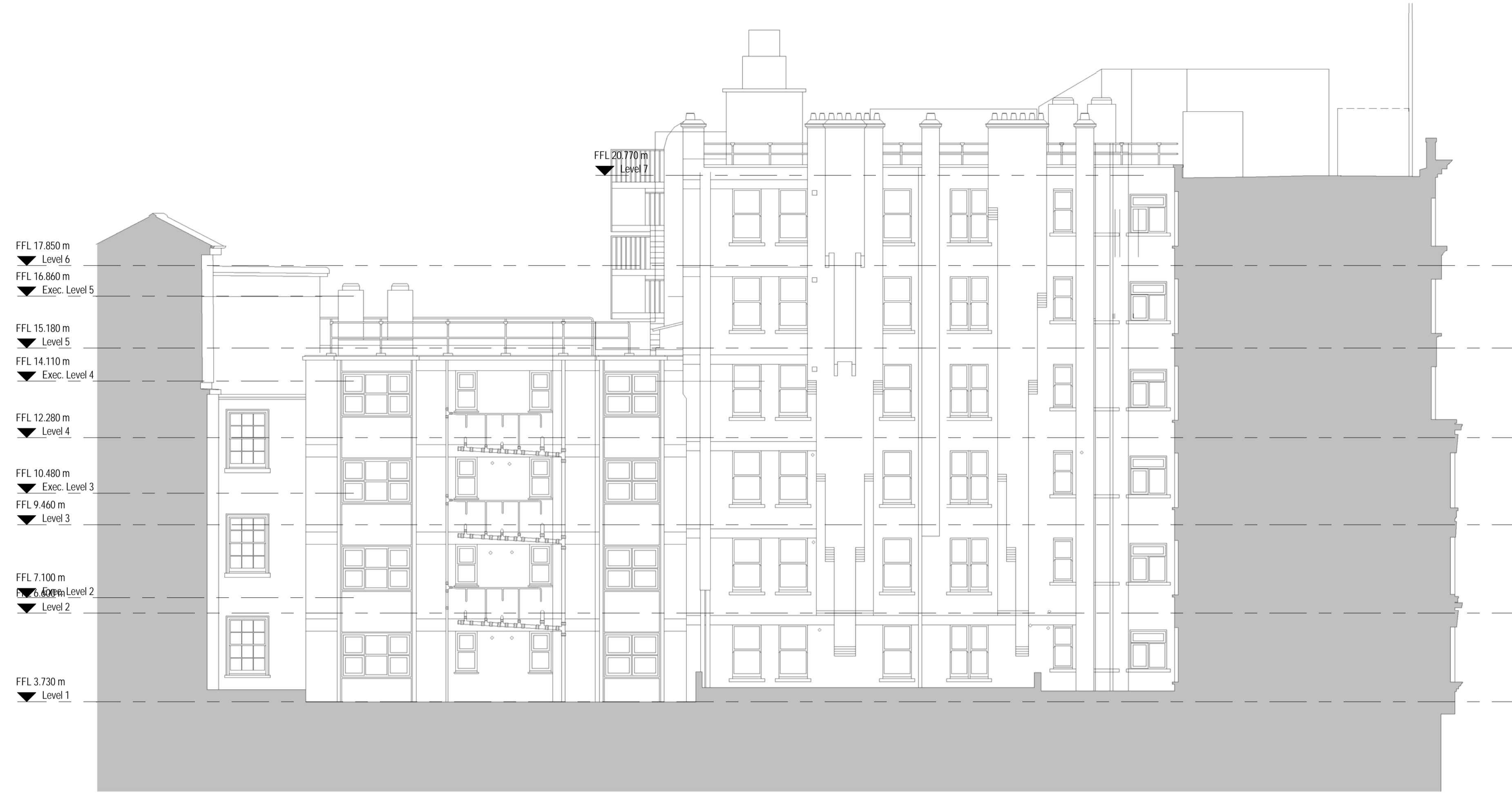
2 West Block 1 as existing 1 : 100