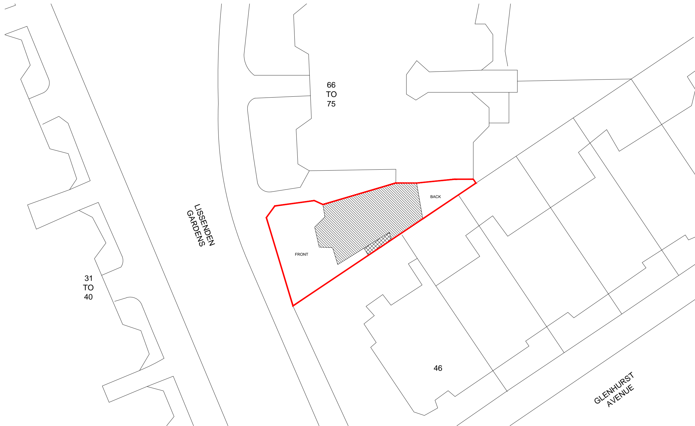
PROPOSED BLOCK PLAN SCALE 1:200