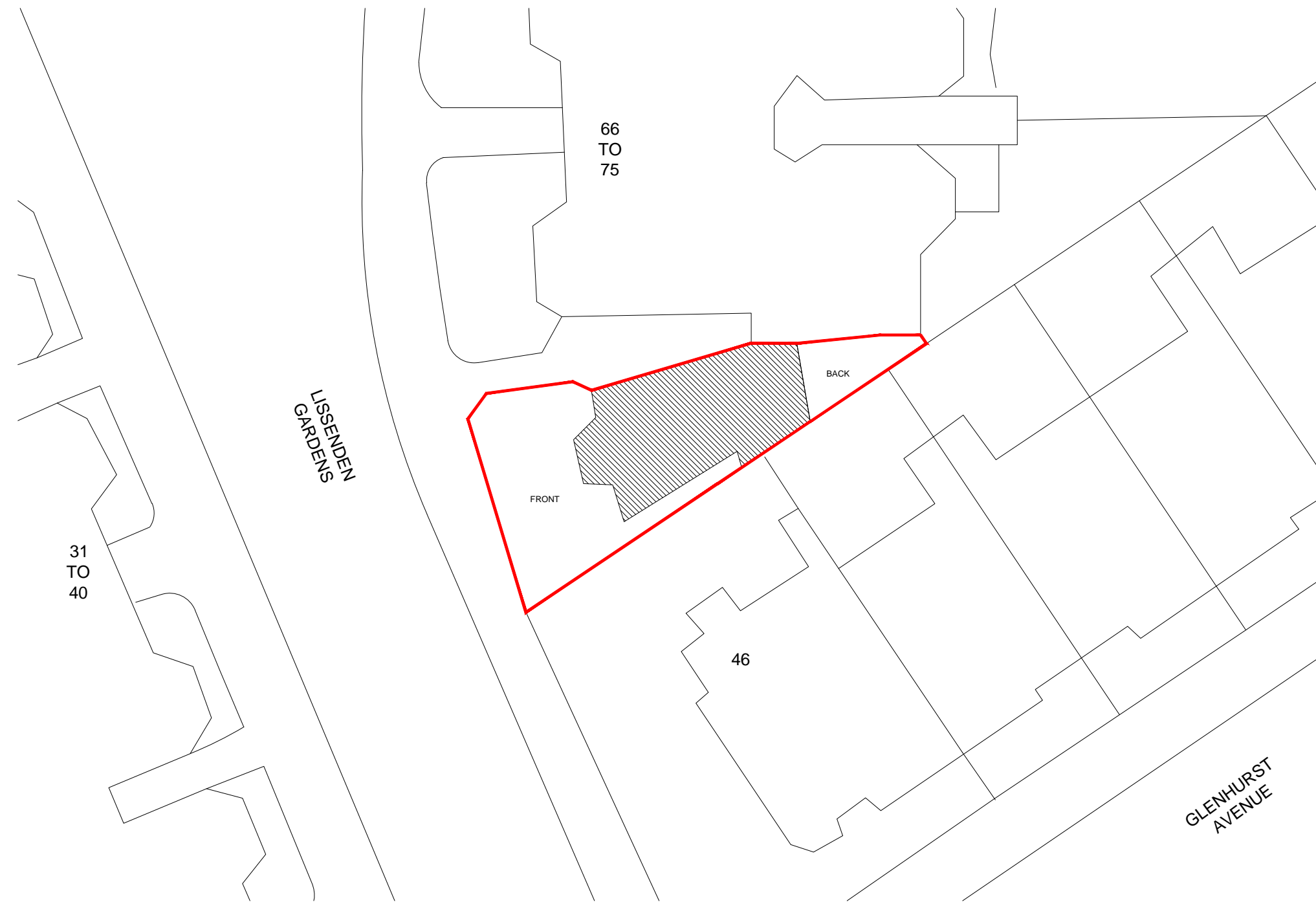
EXISTING BLOCK PLAN SCALE 1:200