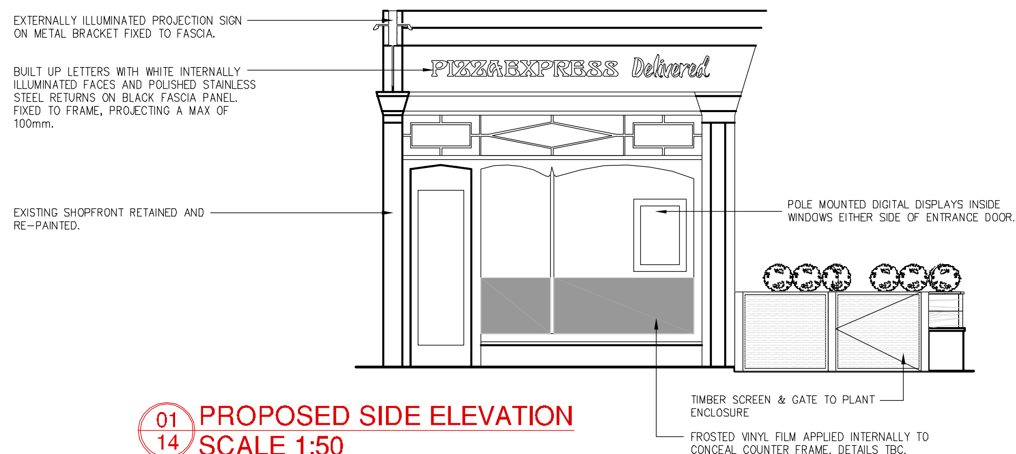
01 PROPOSED SIDE ELEVATION 14 SCALE 1:50