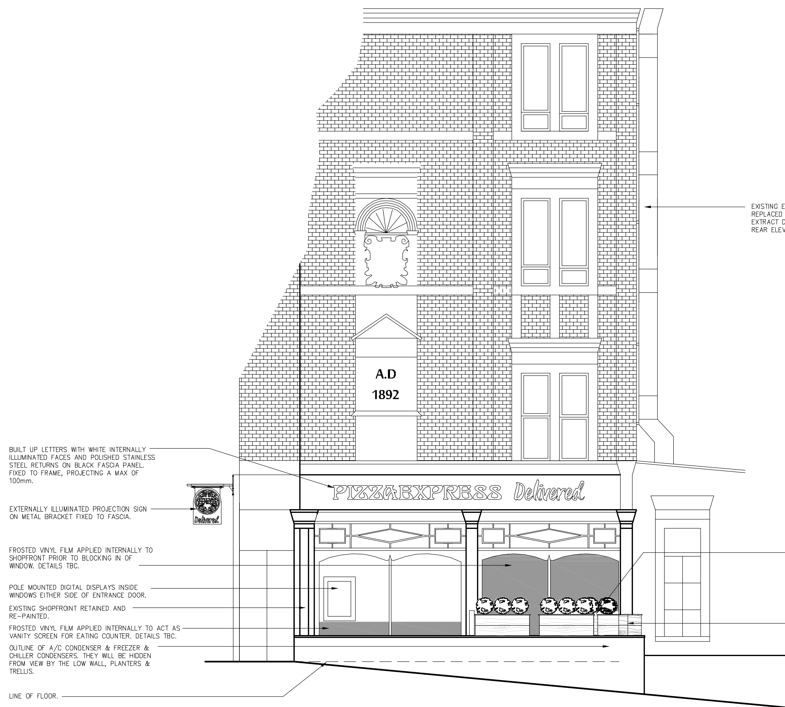
03 PROPOSED SIDE ELEVATION 14 SCALE 1:50