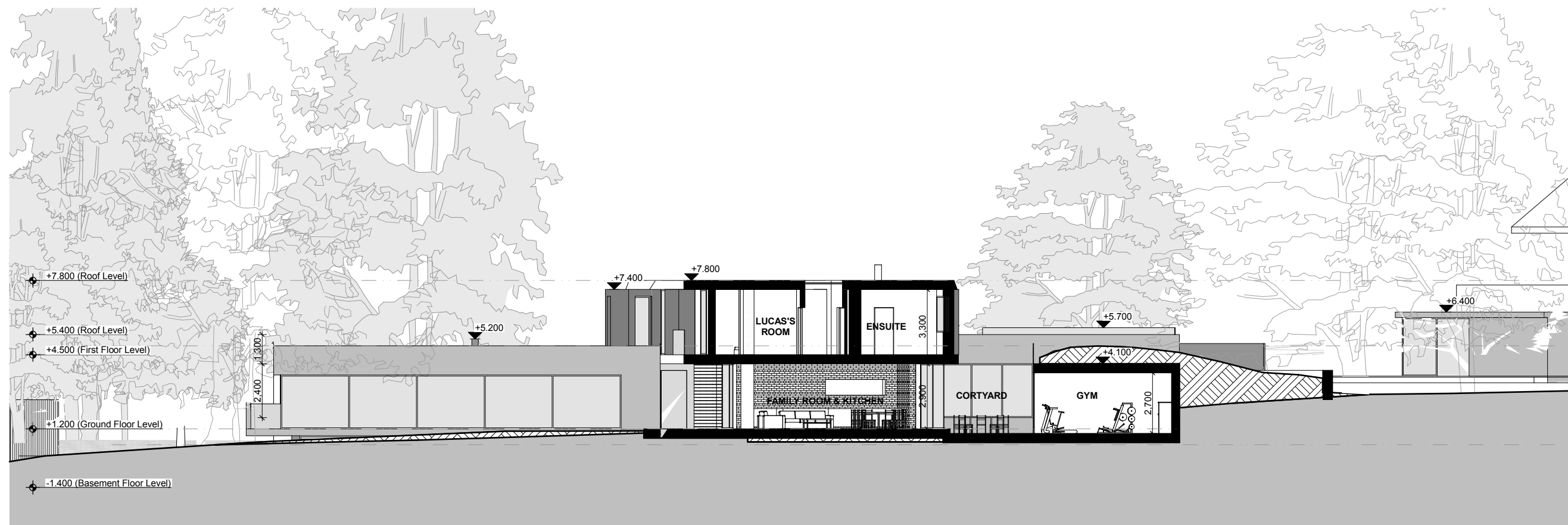
4 SCALE 1:100 @ A1 SECTION DD

Figured dimensions only are to be taken from this drawing. All dimensions are to be checked on site before any work is put in hand. If in doubt, ask.