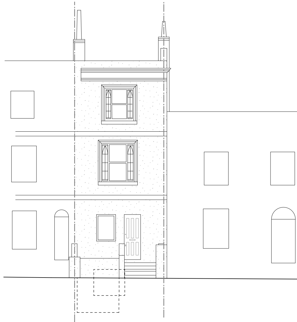
1 EXISTING FRONT ELEVATION SCALE 1:100@A3