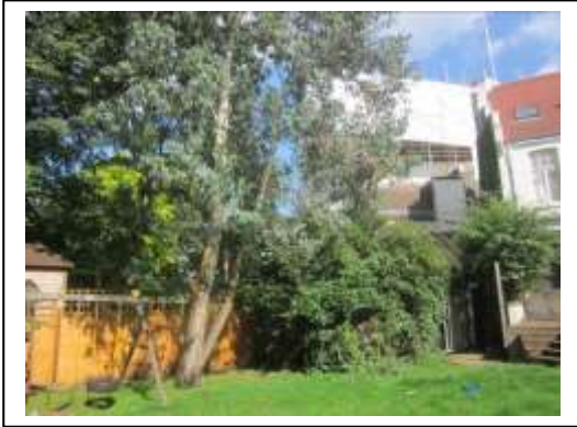
View of eucalyptus T1