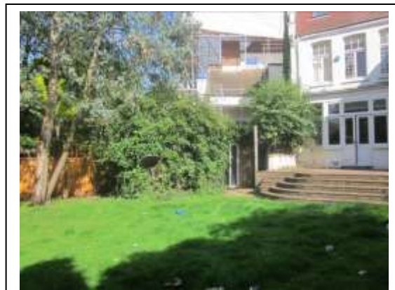
View of ivy covered T2 & T3 and shrubs S1 & S2