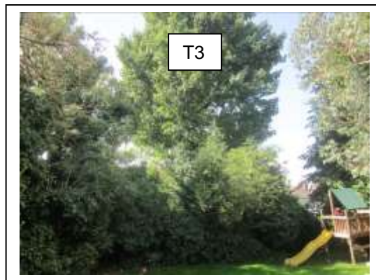
Offsite sycamore T3