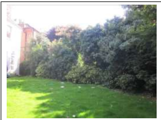
View of group G1