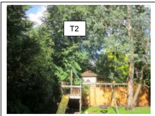
Offsite lime T2