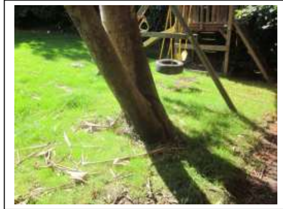
View of base of T1 showing lean and twin stem