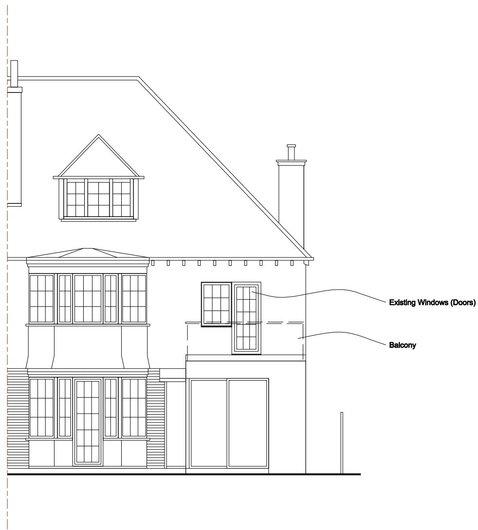
1 EXISTING REAR ELEVATION (WEST) SCALE 1 : 100 at A3