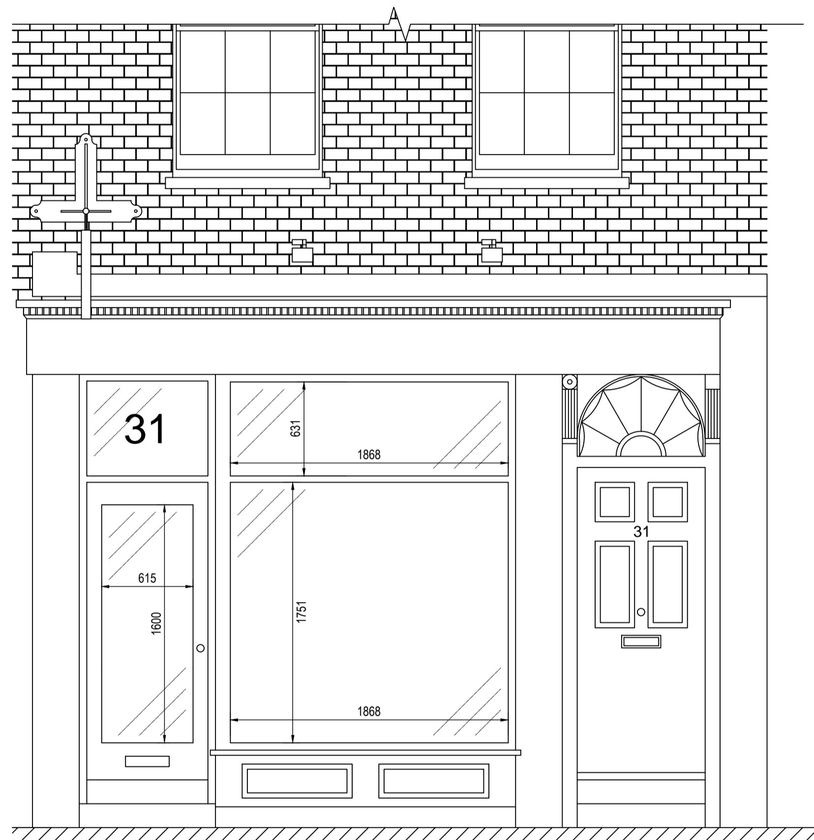
EXISTING SHOPFRONT ELEVATION SCALE 1:25

GENERAL TOLERANCE OF +0.5MM IS ACCEPTED. DO NOT SCALE FROM THIS DRAWING. ALL DIMENSIONS IN MILLIMETERS. ALL DIMENSIONS MUST BE MADE FOR THE REQUIRED FINISH BY MANUFACTURER. ALL DIMENSIONS ARE FINISHED SIZES. THIRD ANGLE PROJECTION UNLESS OTHERWISE STATED. THE SHOPFITTING CONTRACTOR IS TO ENSURE THAT THE CONSTRUCTION METHOD AND INSTALLATION OF THIS FEATURE IS FIT FOR THE PURPOSE FOR WHICH IT IS REQUIRED. HEALTH AND SAFETY MUST BE TAKEN INTO ACCOUNT WHEN DESIGNING, MANUFACTURING, INSTALLING, MAINTAINING AND DISPOSING OF THIS FEATURE. THIS DRAWING REMAINS THE COPYRIGHT OF CHECKLAND KINDLEYSIDES LTD