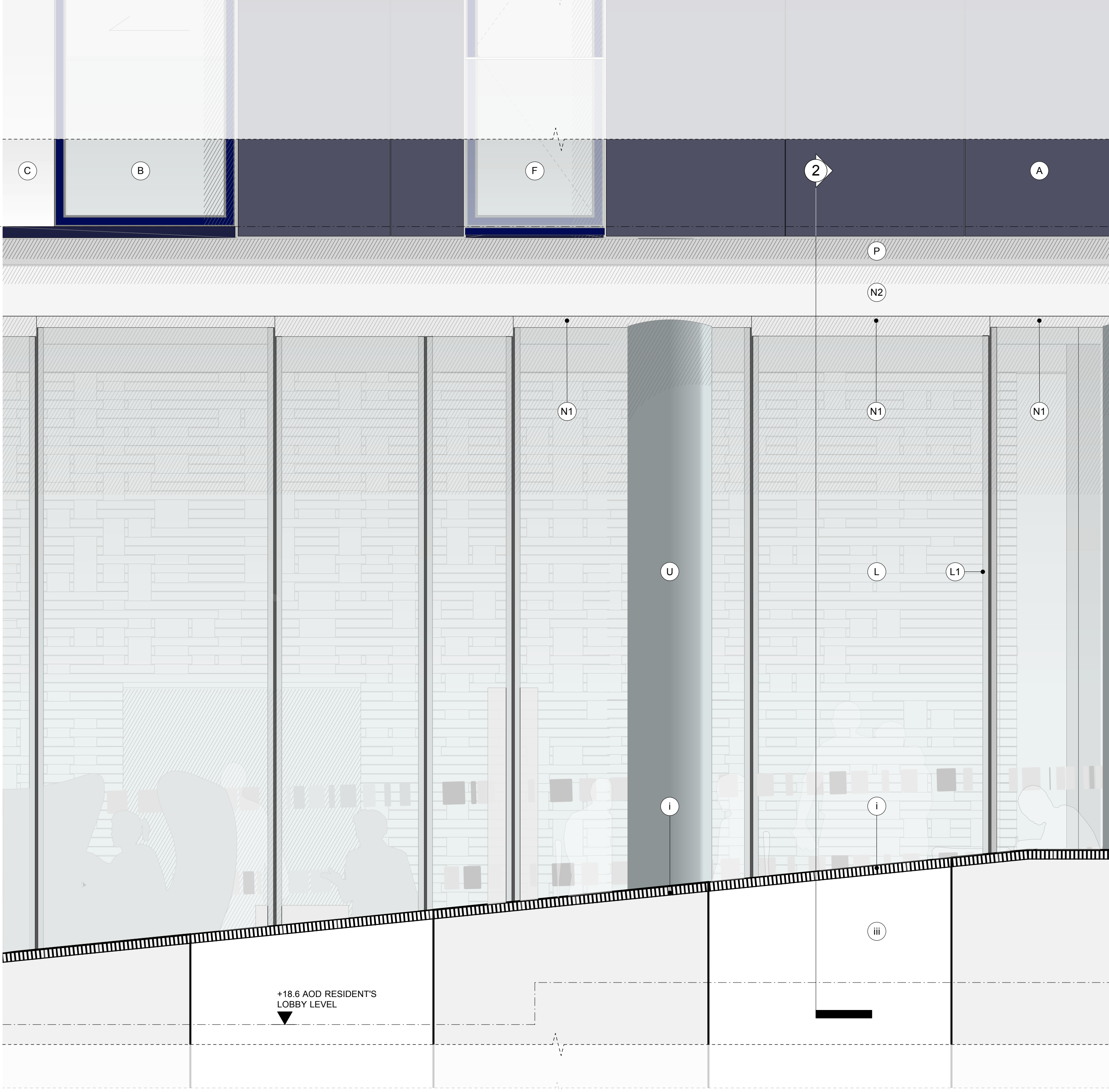
1 TYPICAL LOBBY & LANDSCAPE GROUND FLOOR ELEVATION SCALE 1:20

OTHER i HEEL-GUARD STEEL GRATING ii PEBBLE MARGIN / DRAINAGE CHANNEL iii VENT TO BASEMENT