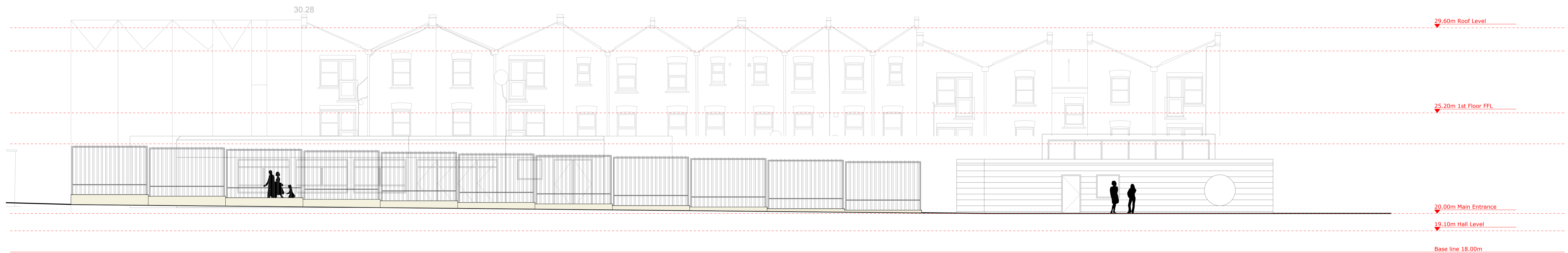
Existing East Elevation 1:100