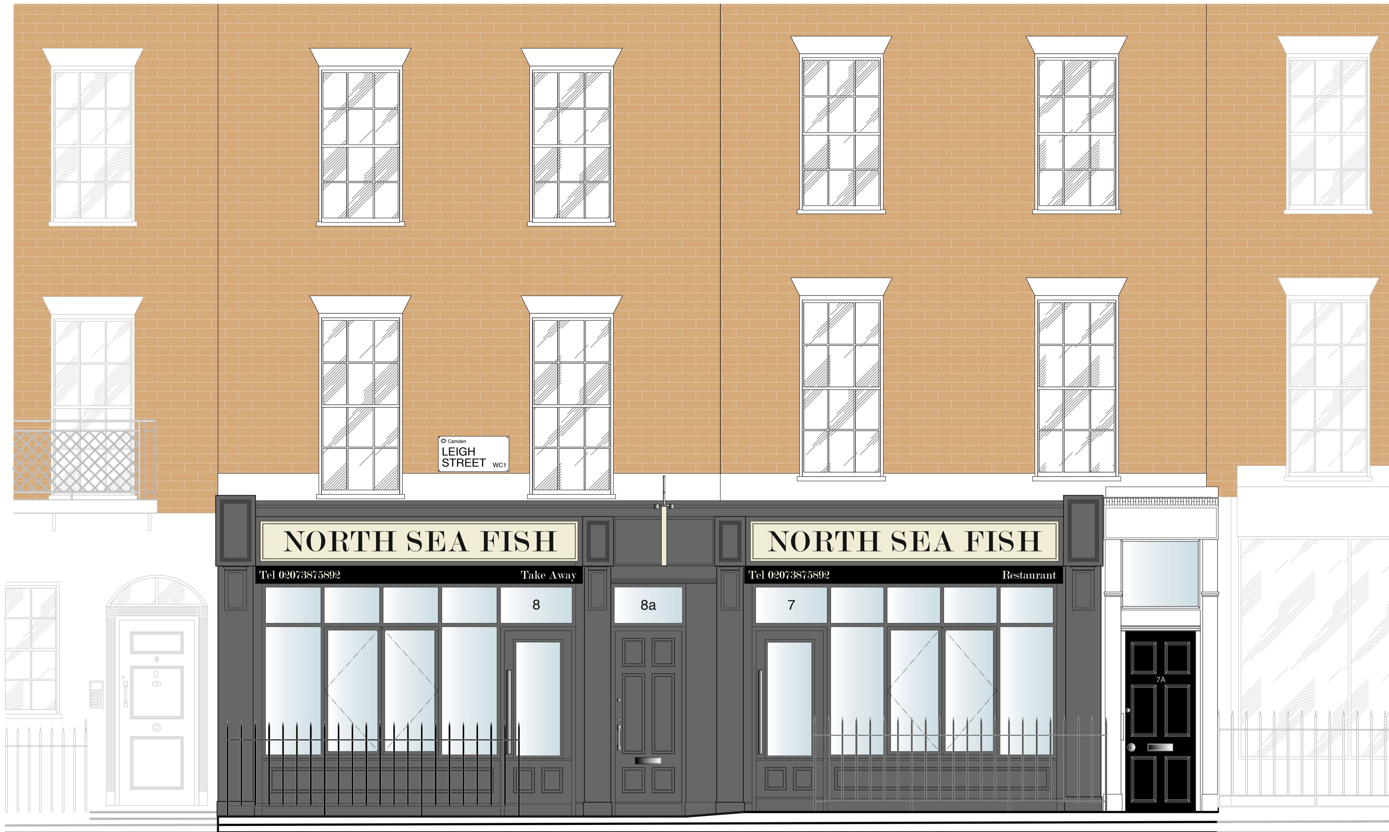
RENDERED EXTERIOR ELEVATION SCALE 1:25 @ A1

NORTH SEA FISH RENDERED EXTERIOR ELEVATION