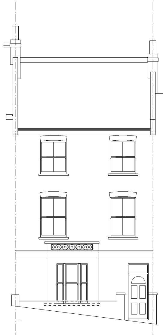
Front Elevation - No Change