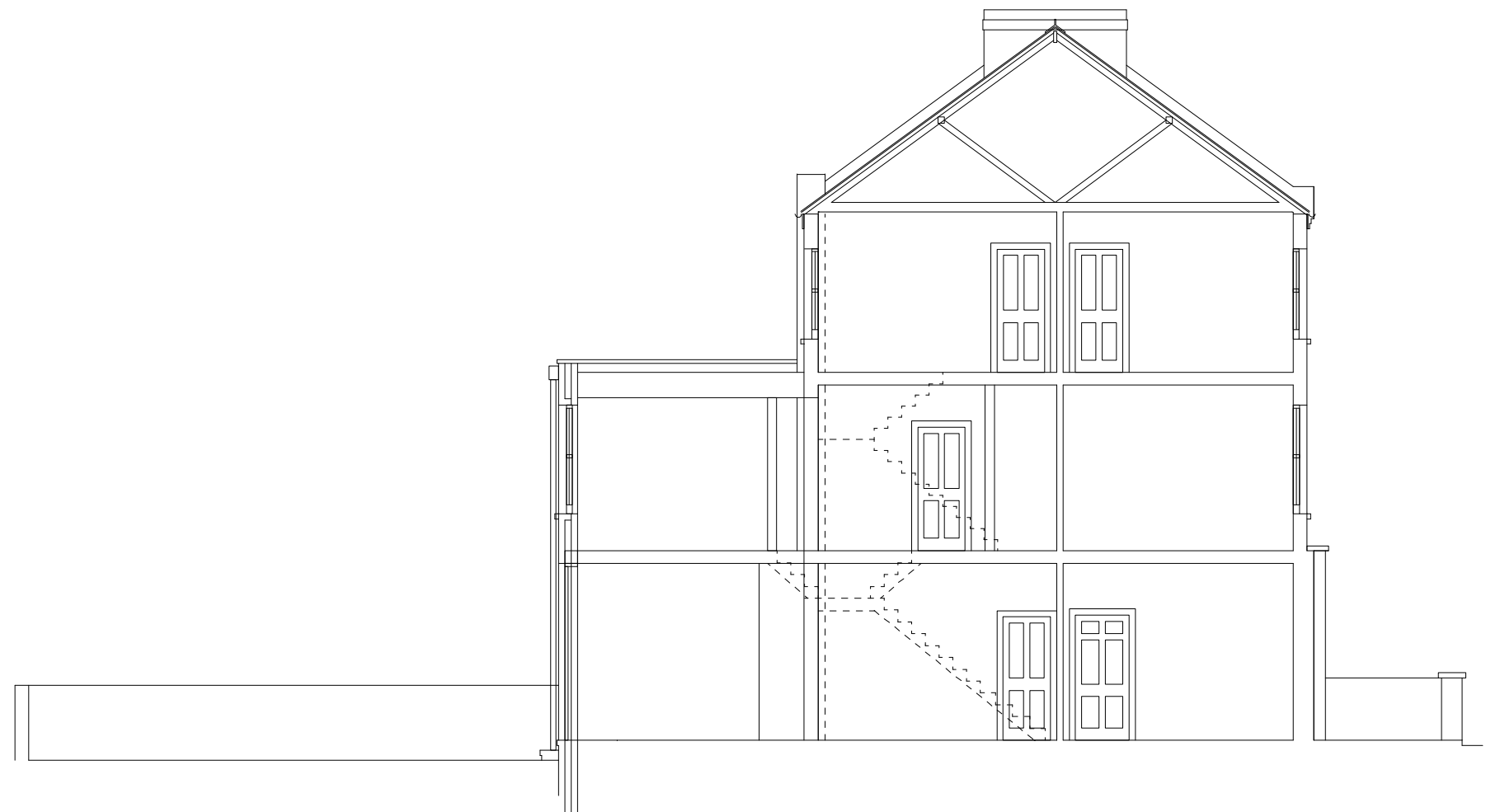
Section as Proposed

PROJECT REAR EXTENSION to HOUSE at 78 CHETWYND ROAD, LONDON NW5 1DH