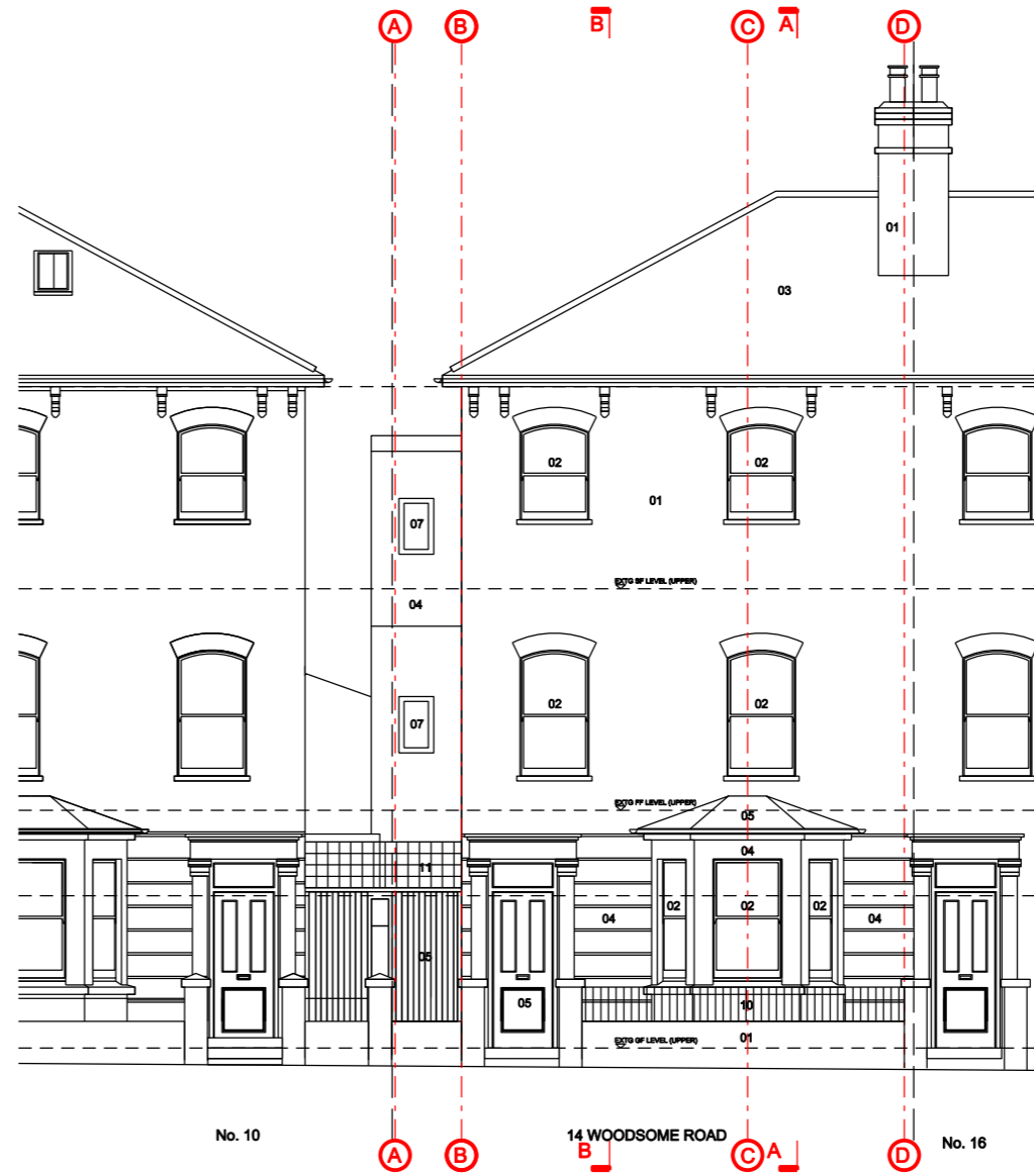
02 EXISTING FRONT ELEVATION SCALE 1:100 AT A3