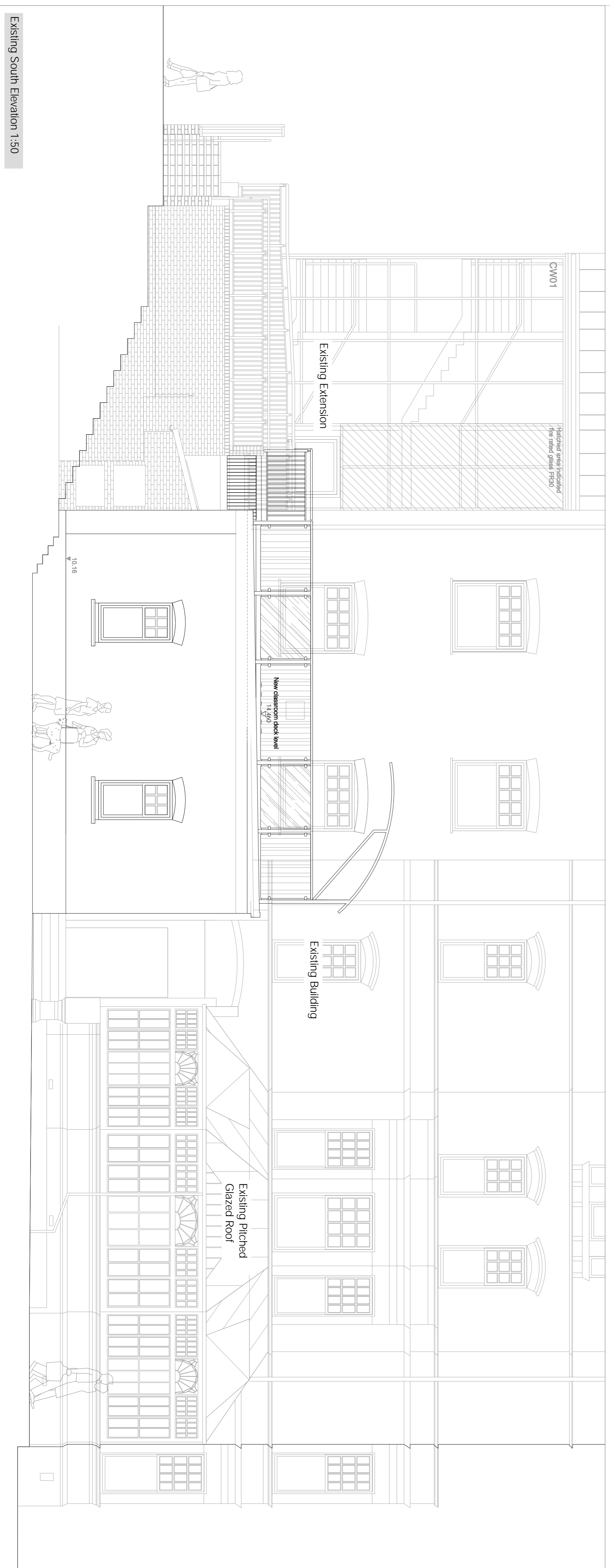
Existing South Elevation 1:50