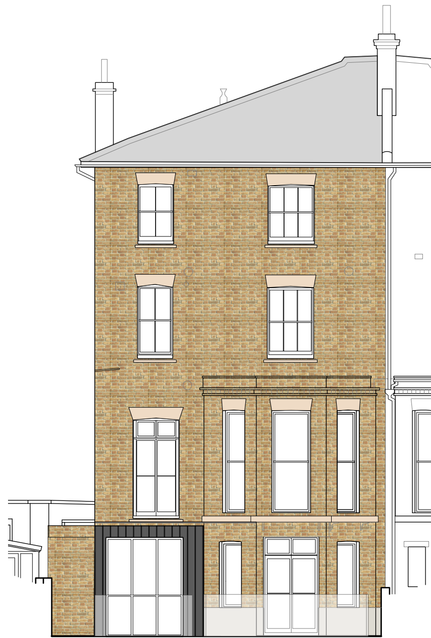
E-E : Rear elevation 1:100

NOTES: Do not scale off this drawing. All Trade Contractors to be responsible for taking & checking their own site dimensions. Any errors or omissions to be reported to Forge Architects and Surveyors Ltd immediately, prior to work being carried out. All site dimensions shown are based upon the measured survey of the property carried out by independent surveyors. The accuracy of this information is not the responsibility of Forge Architects and Surveyors Ltd. Forge Architects & Surveyors Ltd also accept no responsibility for the accuracy of any Structural and Servicing information shown on this drawing. This information is shown for guidance purposes only, and where applicable - is based on information provided by the consulting Structural Engineers, consulting M&E Engineers, client representatives, and/or specialist subcontractors respectively. Reference should always be made to Engineers & Subcontractors current drawings & specifications. This drawing and design is the copyright of Forge Architects and Surveyors Ltd and is not to be used for any purpose without their consent.