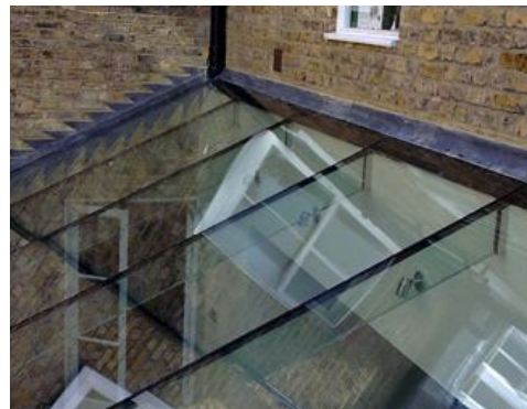
Glazed side passage