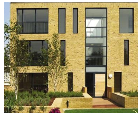
Velfac windows in brick facade