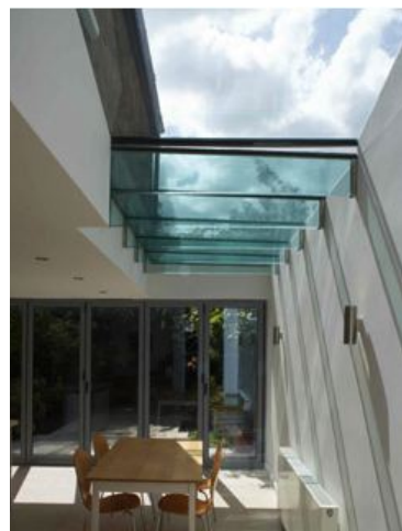
Glazed side passage - interior