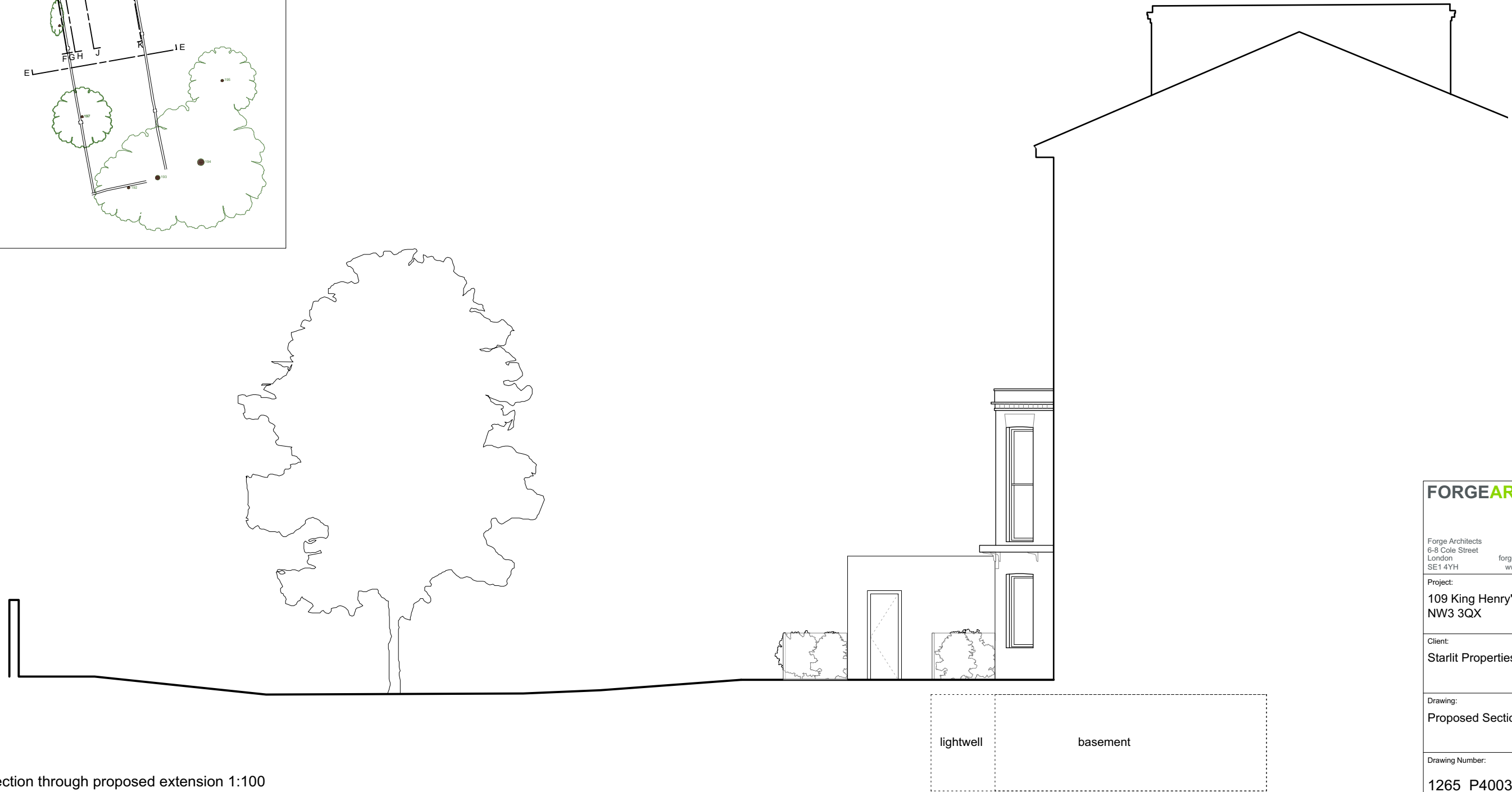
K-K : Section through proposed extension 1:100