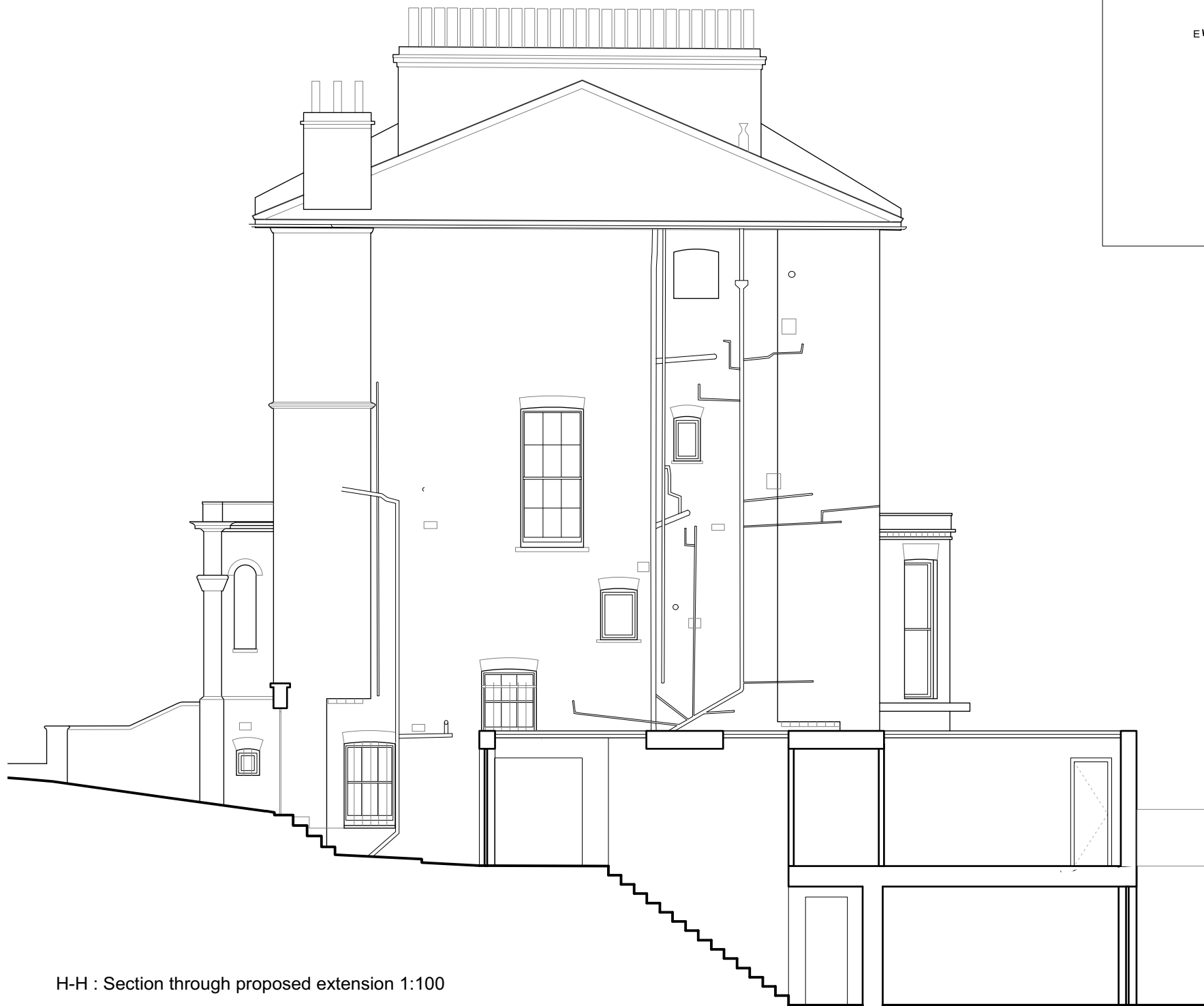
H-H : Section through proposed extension 1:100