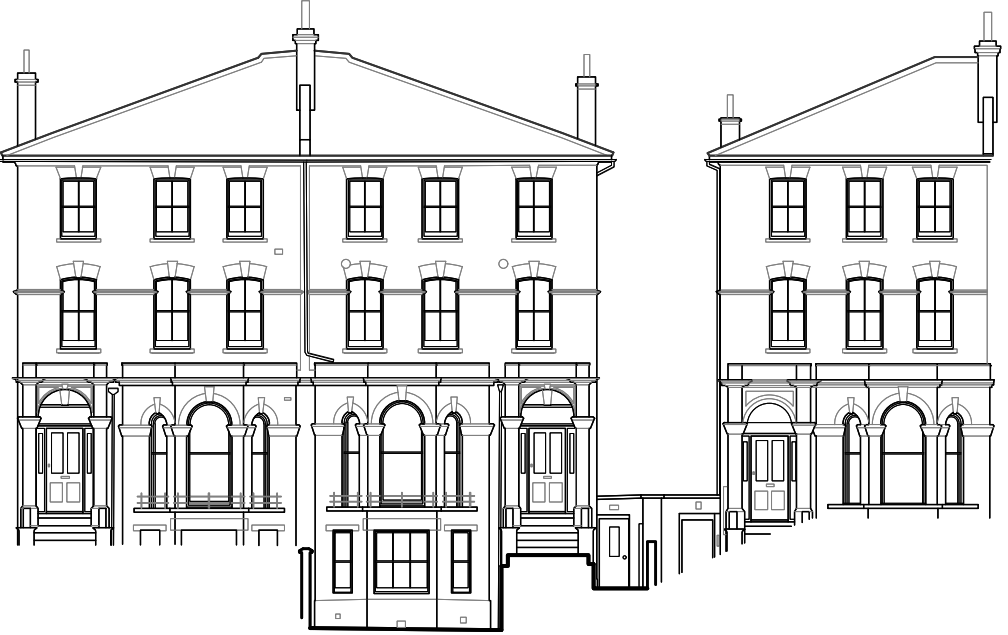
A-A : Elevation from King Henrys Rd 1:200