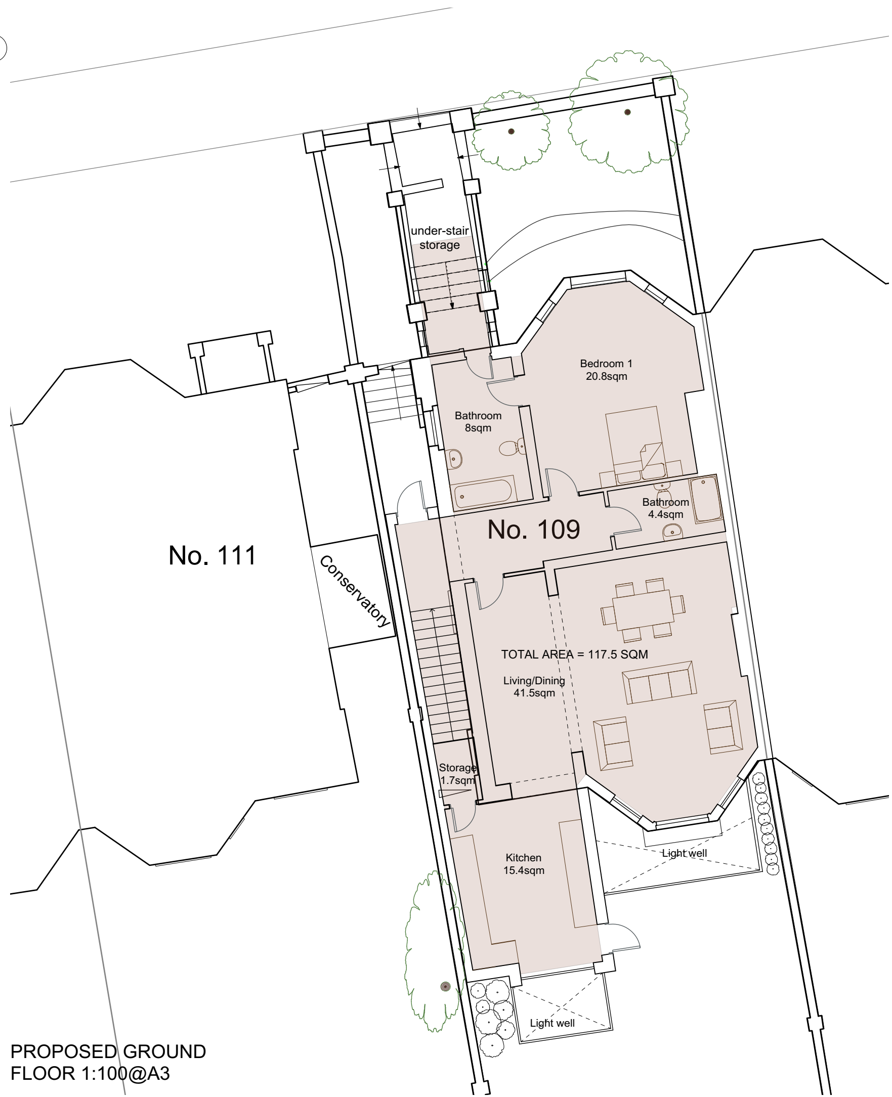
PROPOSED GROUND FLOOR 1:100@A3

NOTES: Do not scale off this drawing. All Trade Contractors to be responsible for taking & checking their own site dimensions. Any errors or omissions to be reported to Forge Architects and Surveyors Ltd immediately, prior to work being carried out. All site dimensions shown are based upon the measured survey of the property carried out by independent surveyors. The accuracy of this information is not the responsibility of Forge Architects and Surveyors Ltd Forge Architects & Surveyors Ltd also accept no responsibility for the accuracy of any Structural and Servicing information shown on this drawing. This information is shown for guidance purposes only, and where applicable - is based on information provided by the consulting Structural Engineers, consulting M&E Engineers, client representatives, and/or specialist subcontractors respectively. Reference should always be made to Engineers & Subcontractors current drawings & specifications. This drawing and design is the copyright of Forge Architects and Surveyors Ltd and is not to be used for any purpose without their consent.