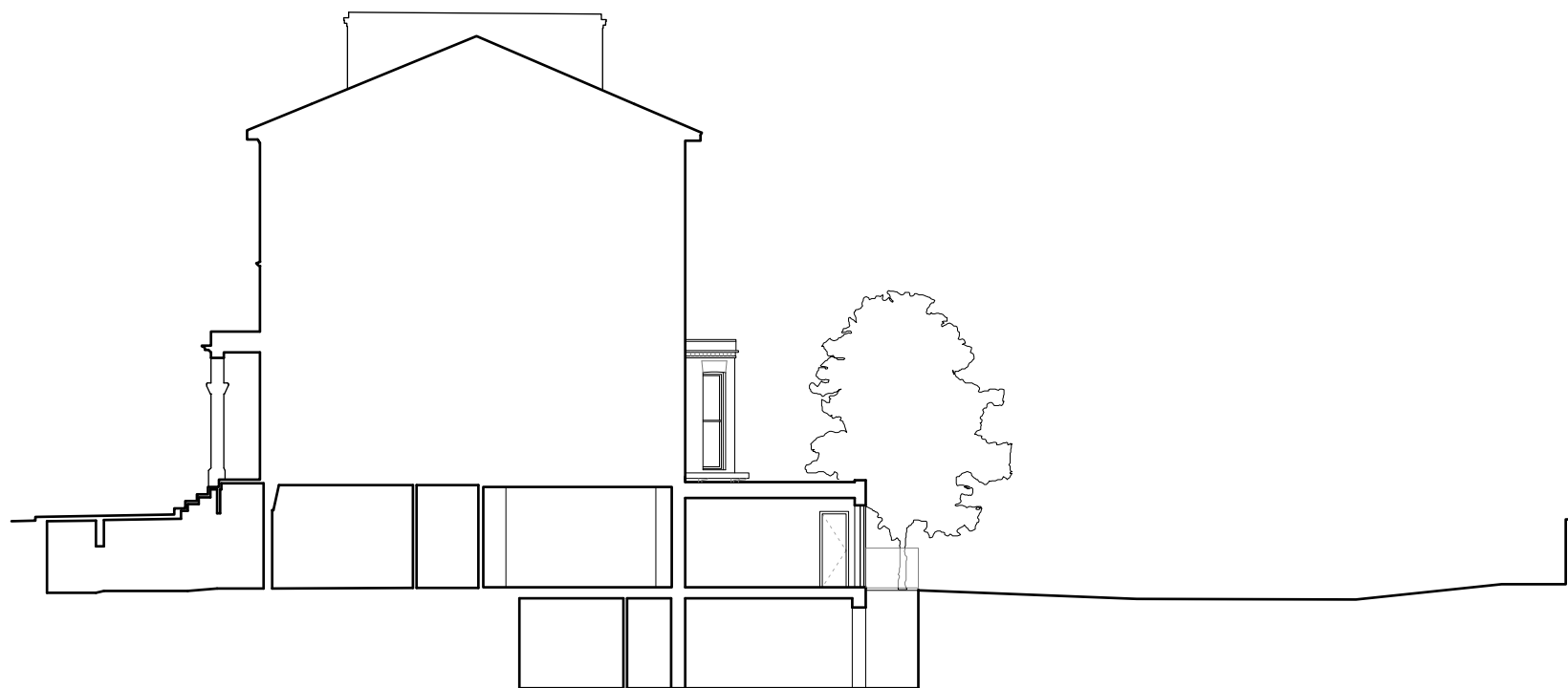
J-J : Section 1:200