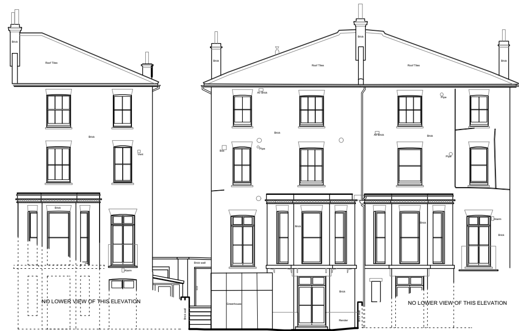
E-E : Rear Elevation