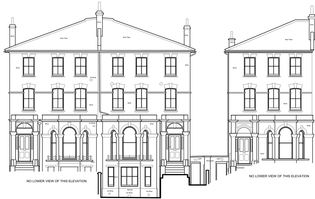
A-A : Elevation from King Henrys Rd

NOTES: Do not scale off this drawing. All Trade Contractors to be responsible for taking & checking their own site dimensions. Any errors or omissions to be reported to Forge Architects and Surveyors Ltd immediately, prior to work being carried out. All site dimensions shown are based upon the measured survey of the property carried out by independent surveyors. The accuracy of this information is not the responsibility of Forge Architects and Surveyors Ltd. Forge Architects & Surveyors Ltd also accept no responsibility for the accuracy of any Structural and Servicing information shown on this drawing. This information is shown for guidance purposes only, and where applicable - is based on information provided by the consulting Structural Engineers, consulting M&E Engineers, client representatives, and/or specialist subcontractors respectively. Reference should always be made to Engineers & Subcontractors current drawings & specifications. This drawing and design is the copyright of Forge Architects and Surveyors Ltd and is not to be used for any purpose without their consent.