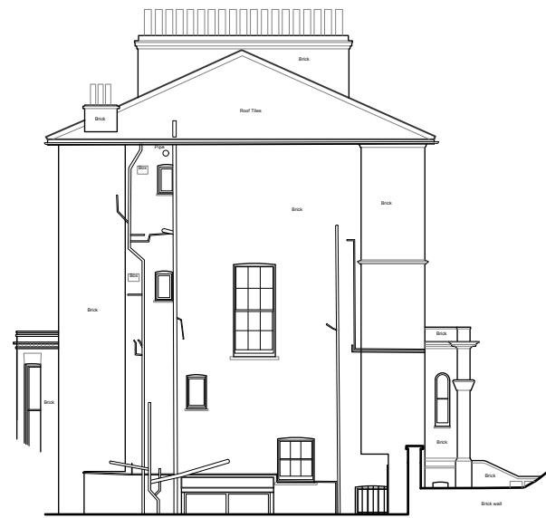
F-F : Elevation of Adjacent Property (no. 111)