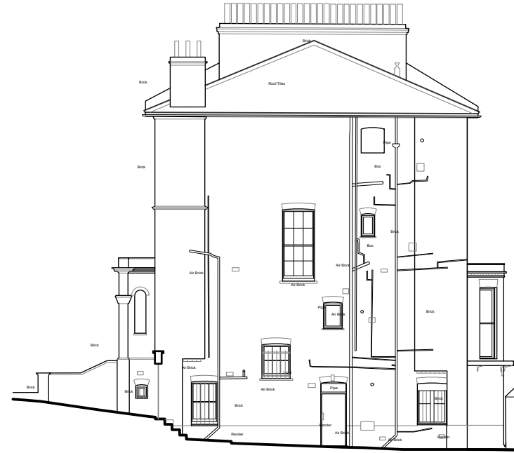
H-H : Side Elevation