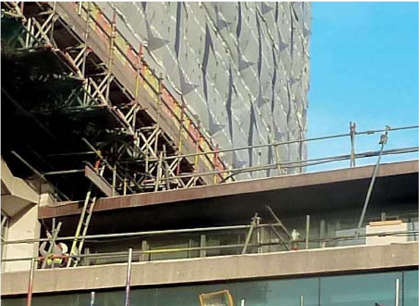
FIG. 4. CHEVRON SAMPLE PLACED ON L2 CENTRE POINT LINK. Sample was in a similar orientation and height as proposals and deliberately placed a little closer to the tower. Weather was dry.