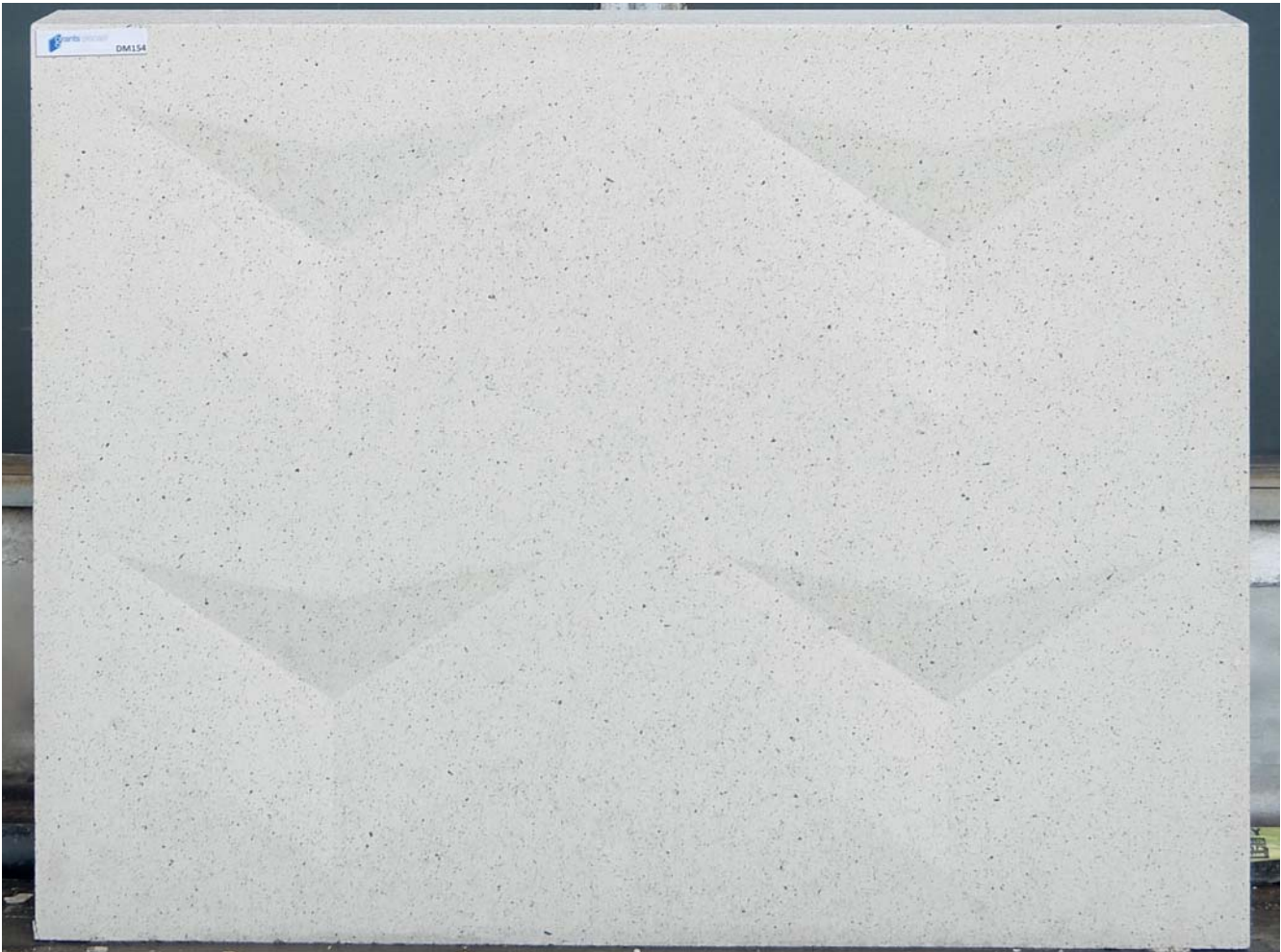
FIG. 3. SAMPLE 154 - WHITE CONCRETE MIX WITH AGGREGATE.

The sample is positioned on site. It can be arranged for the case officer to visit site to view the sample shown in fig. 3.