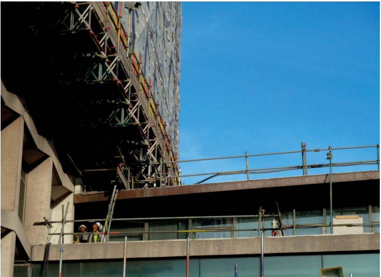
FIG. 5. CHEVRON SAMPLE PLACED ON L2 CENTRE POINT LINK, sample was in a similar orientation and height as proposals and deliberately placed a little closer to the tower. Weather was dry.