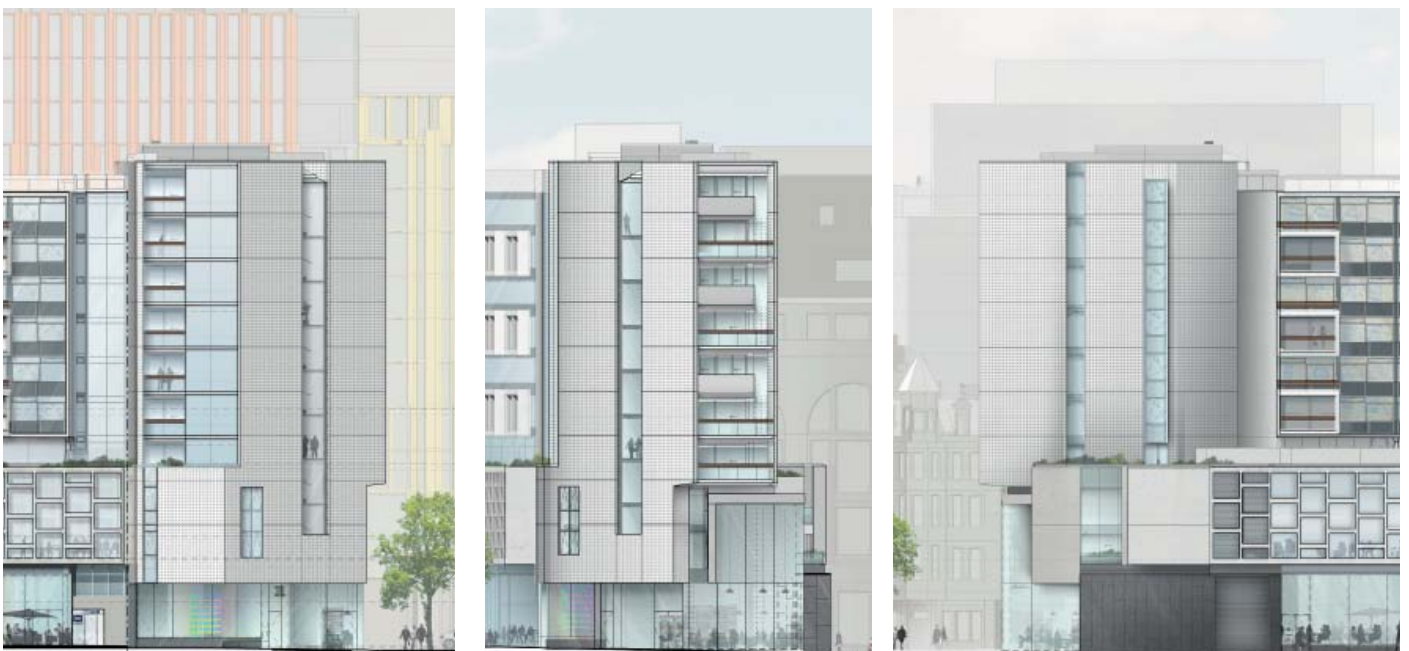
FIG. 1. ELEVATION DRAWINGS AS PER PLANNING SUBMISSION