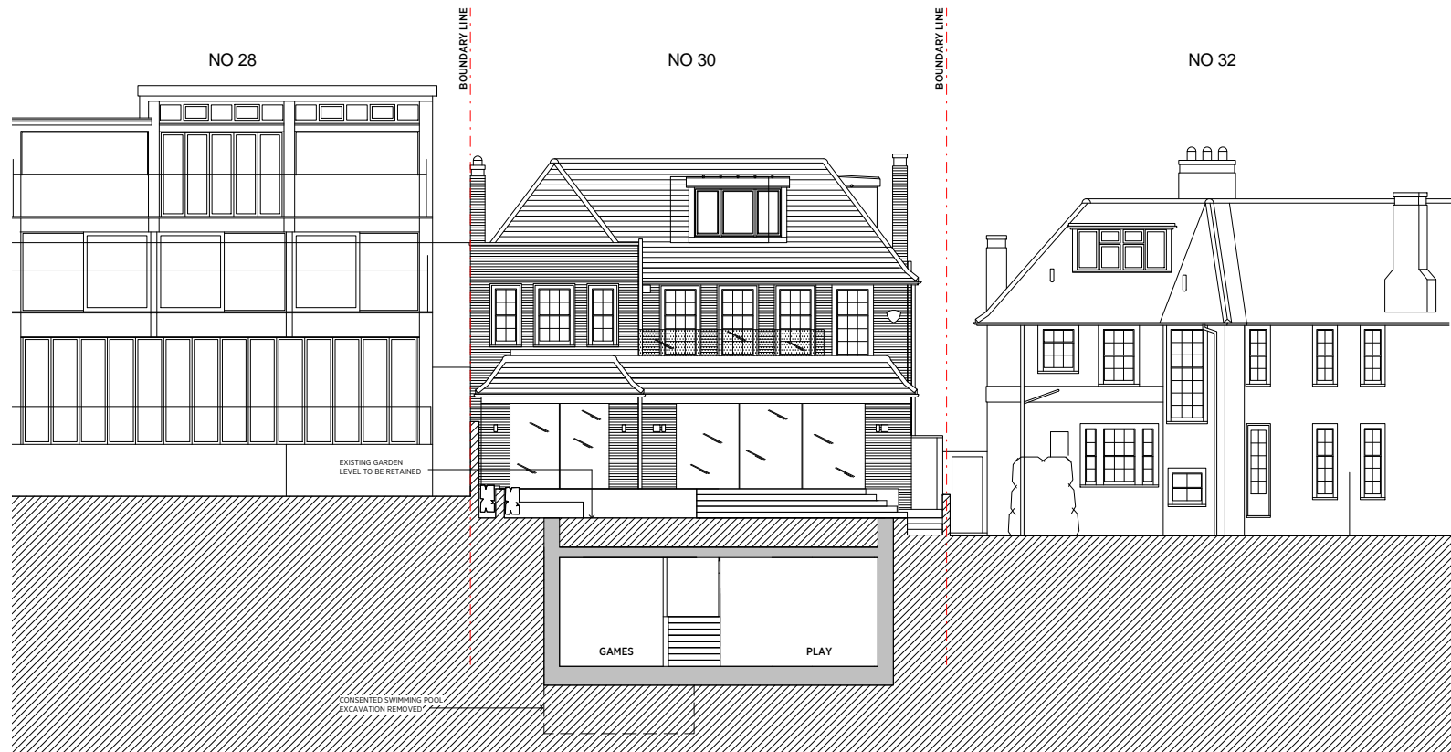
PROPOSED SECTION C