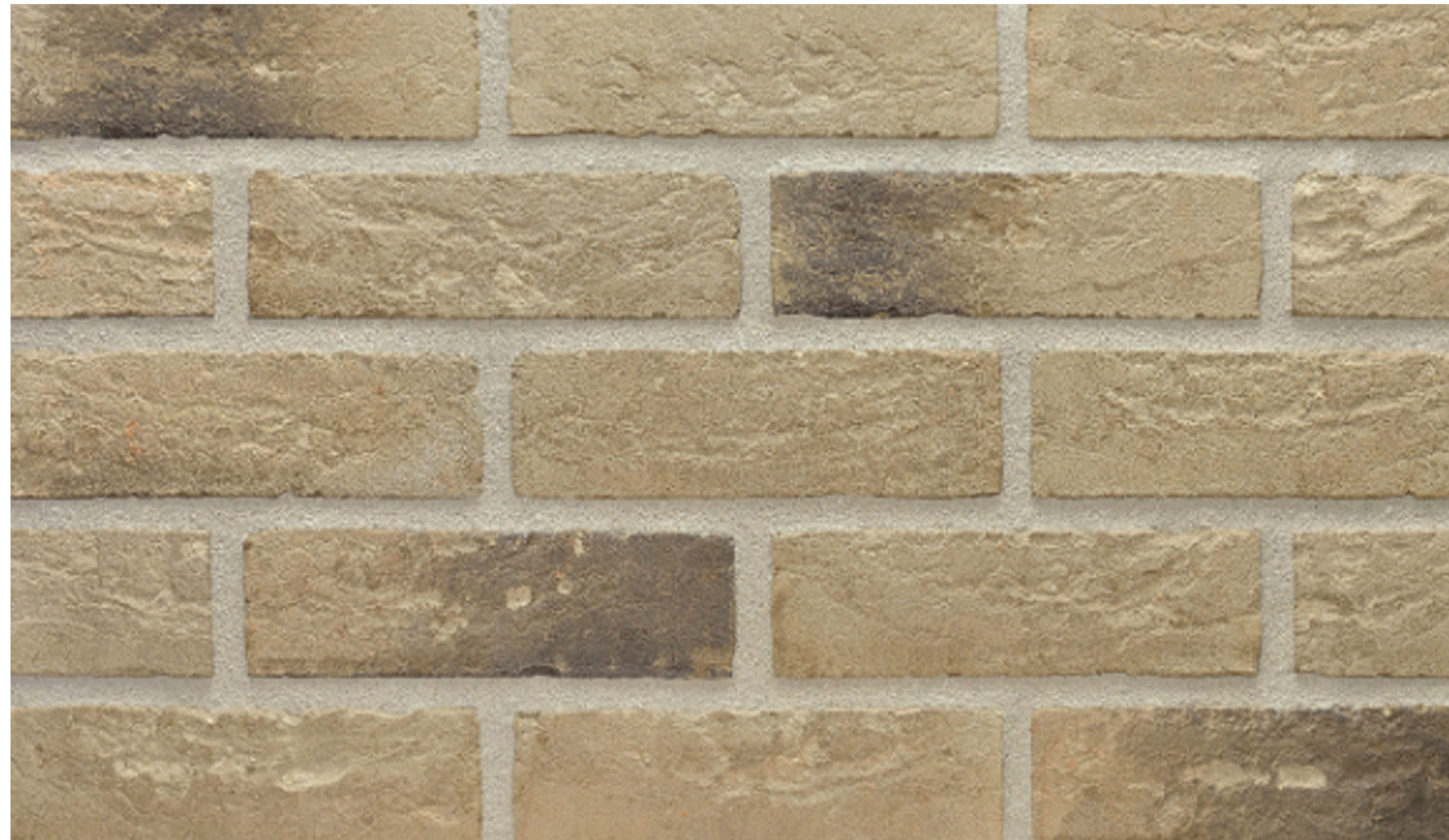
Fuji Bespoke Brick