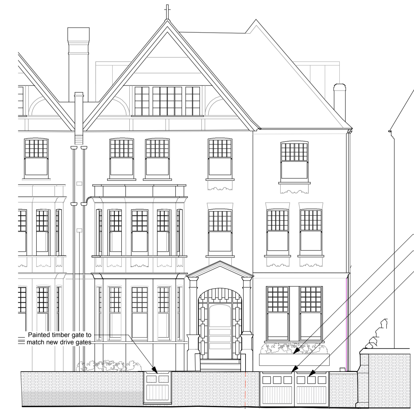
6 PROPOSED ELEVATION