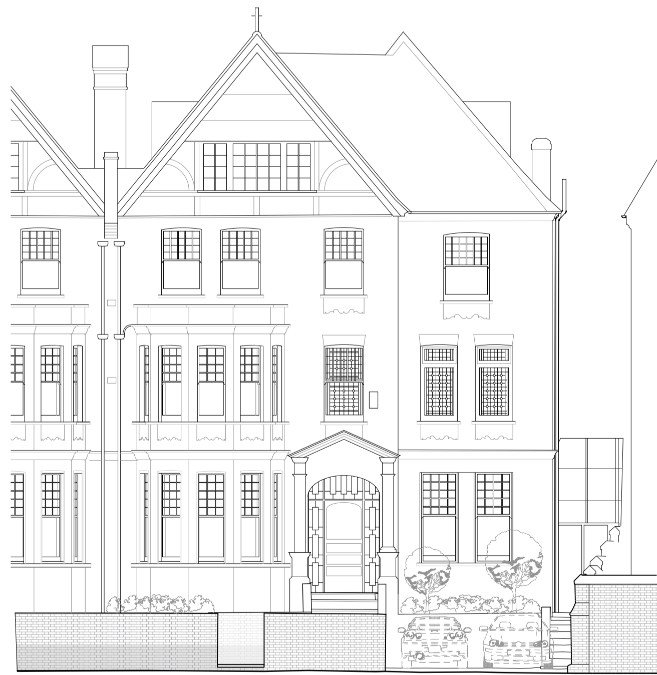
4 EXISTING ELEVATION