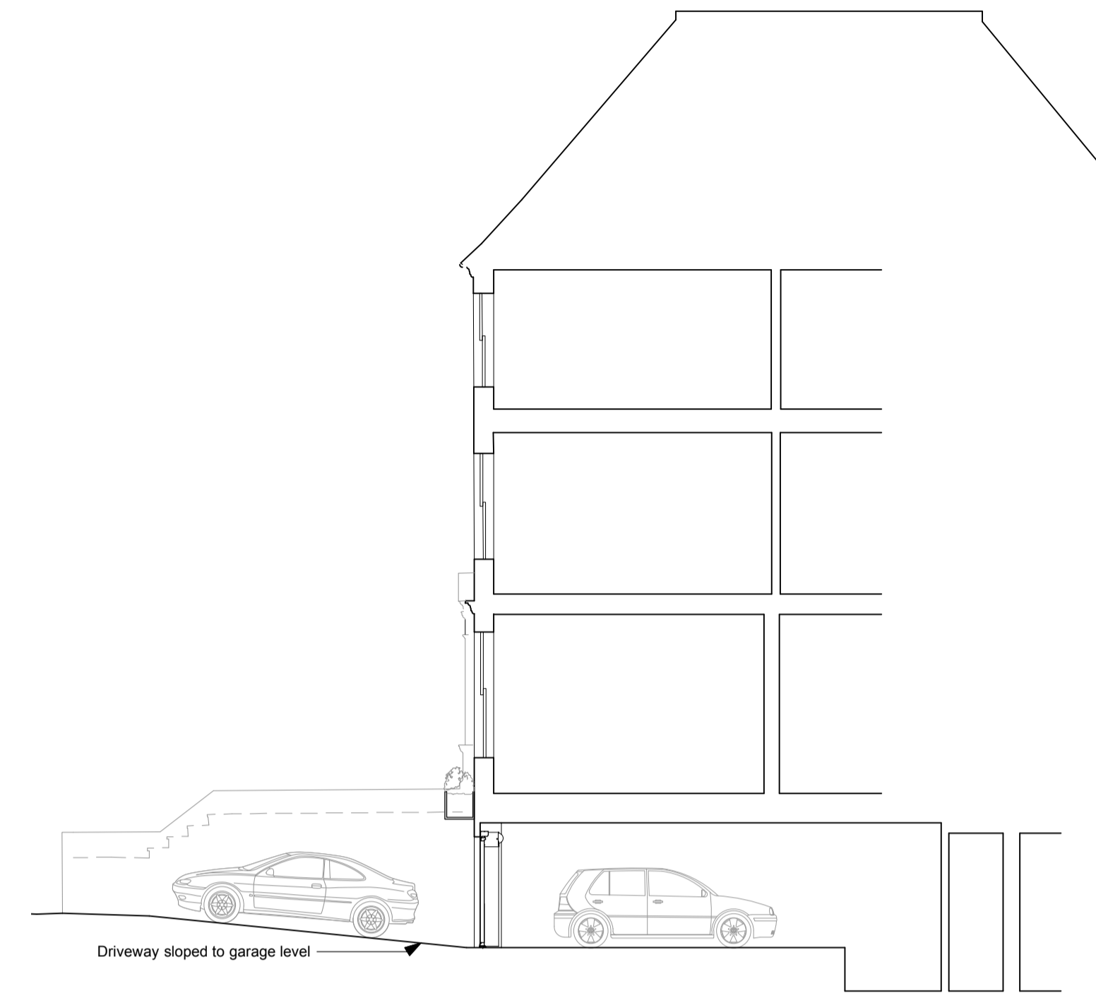
3 PROPOSED SECTION