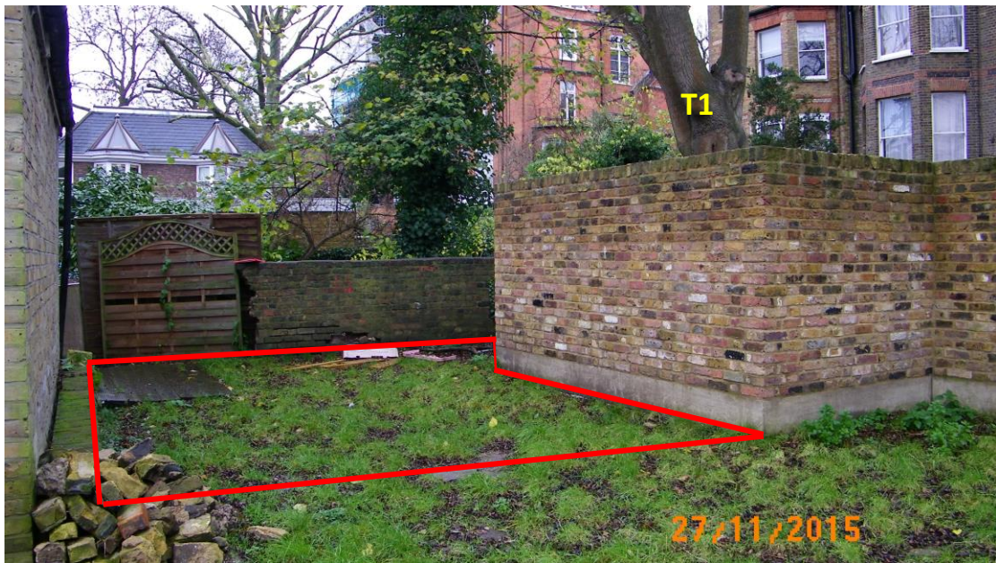
Fig.3 View of site, showing area in which arboricultural supervision will be required during any excavation or ground works i.e. within red line