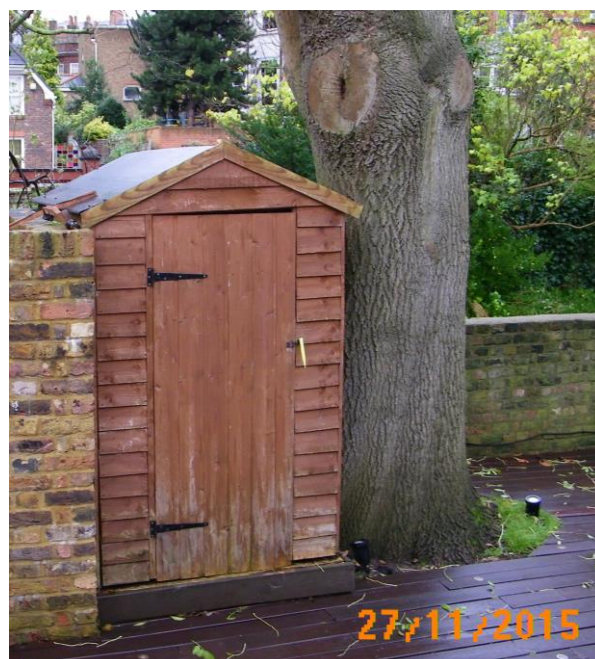
Fig.1 Subject tree T1 as seen from Ellerdale Road, looking east