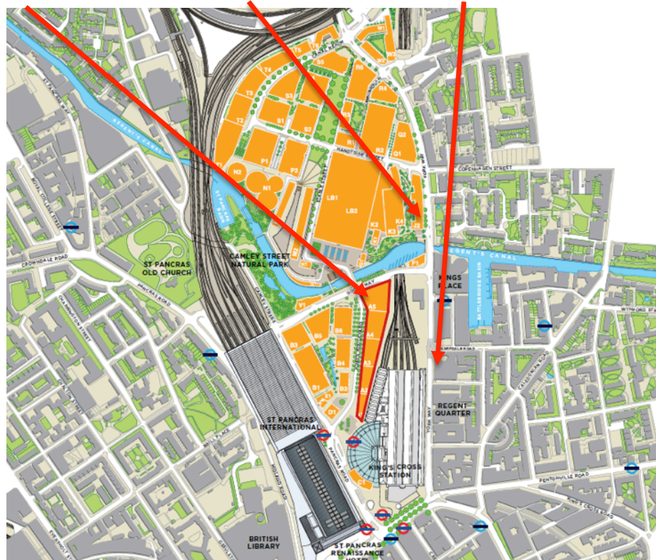
Proposed Site Residential Dwellings Residential Dwellings

The venue site follows the previously defined shape of Zone 'A' and no permanent alterations have been made to the physical features of layout of this space. The King's Cross Theatre venue is wholly contained within the site as defined above and shown below.