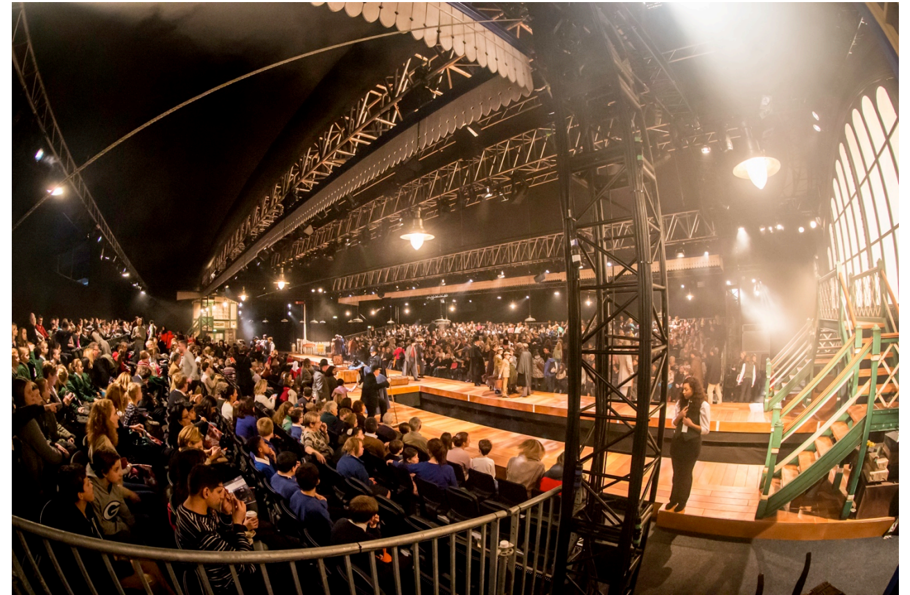
Inside The King's Cross Theatre

Although the events attract a large number of people, these are spread over a seven day working period. This means that the venue will be able to adequately satisfy the needs of the local theatre goers, without the usual traffic, noise and litter problems that would usually be associated with a one-day event that would attract a similar number of people (such as an outdoor festival or concert).