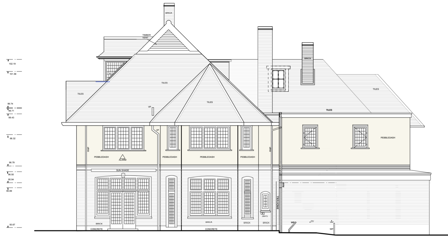
DATUM 92.00m A.O.D. SOUTH GARDEN ELEVATION