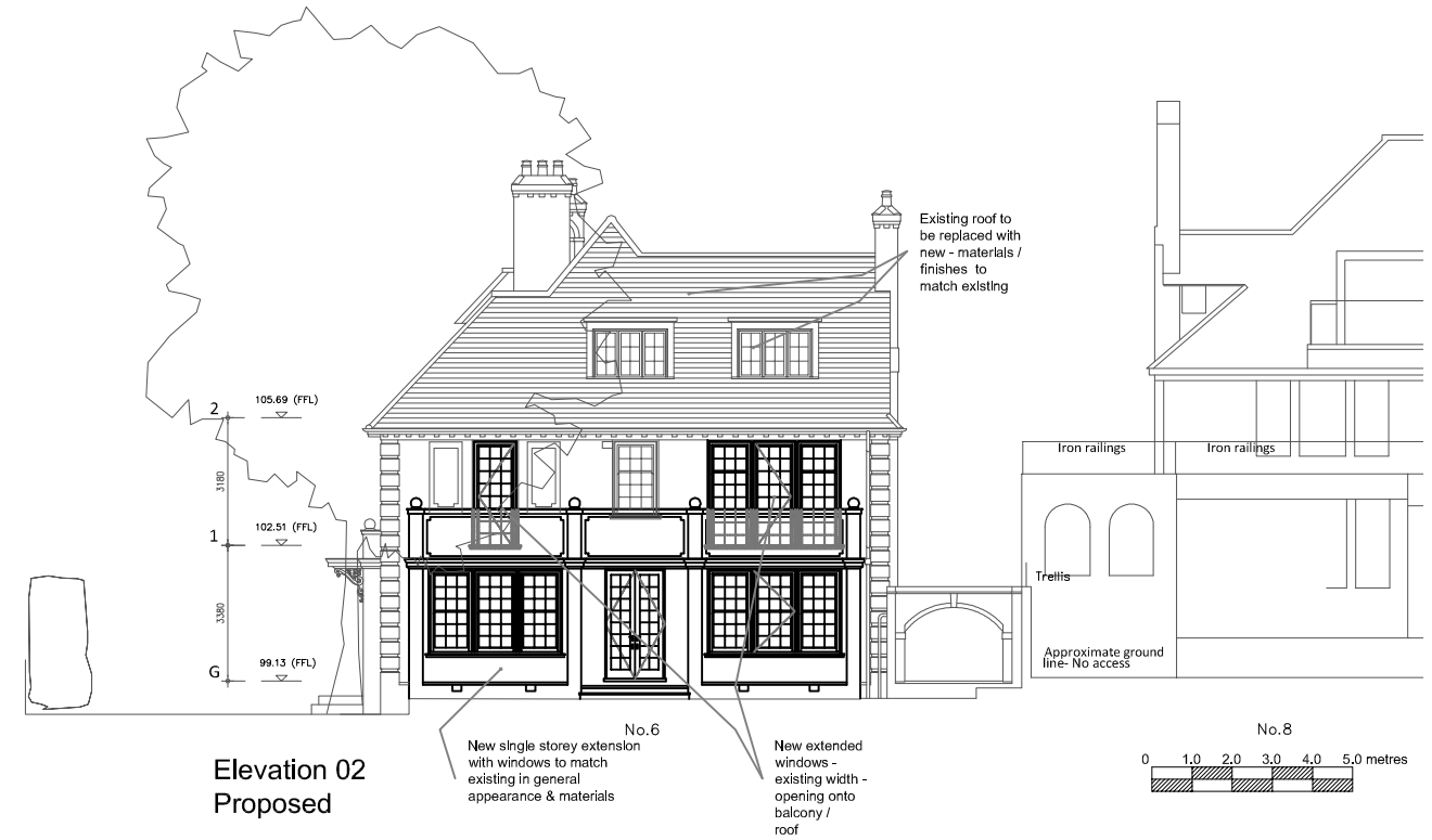
Elevation 02 Proposed