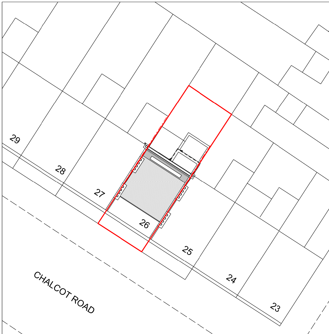
SITE BLOCK PLAN