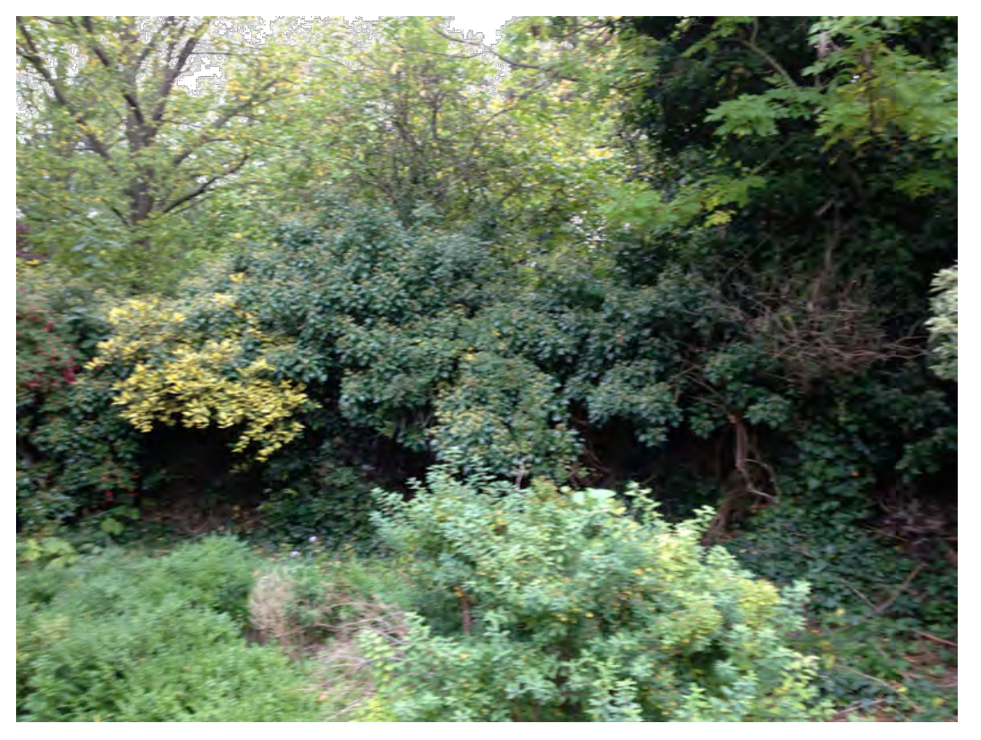
View 4 Boundary fence to 40 and 41 Steele's Road - clear shrubs and erect new timber fence.