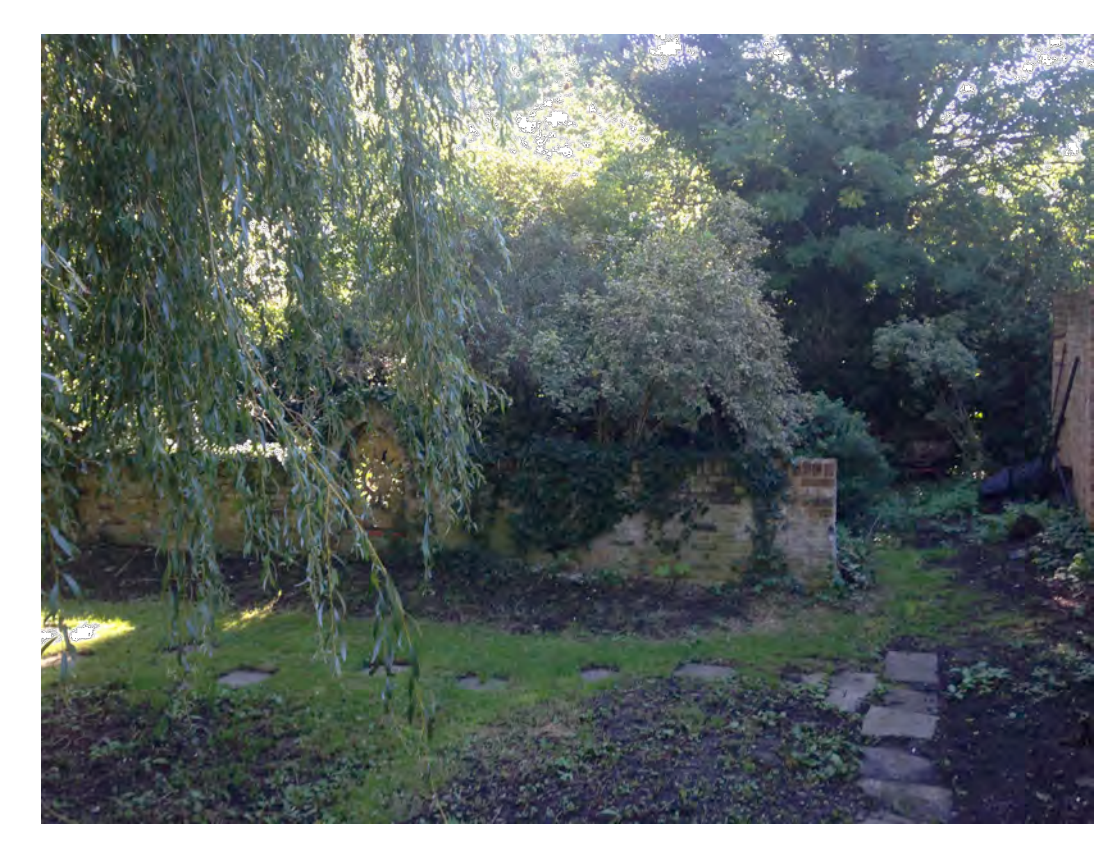
View 3 General view to rear of garden - retain existing low brick dividing wall, locate pool behind.