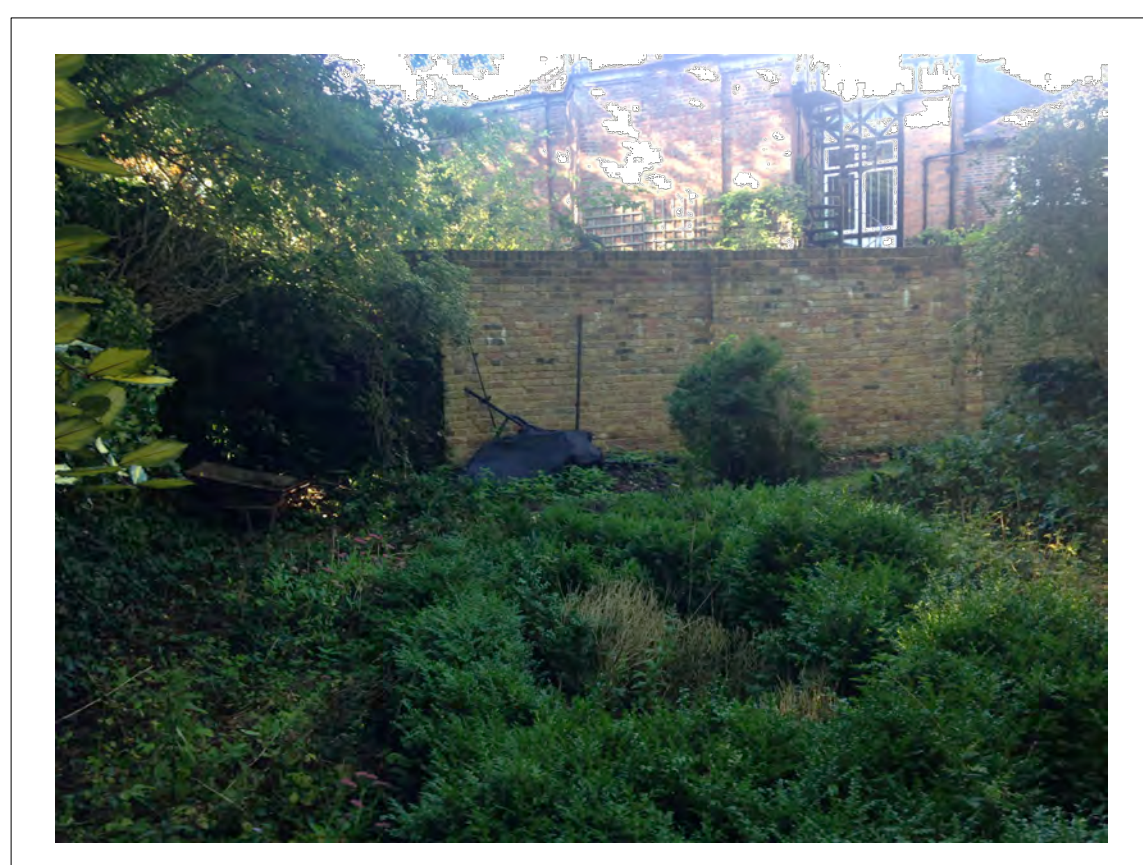
View 1 Boundary wall to 50 Primrose Hill Road - retain as existing.