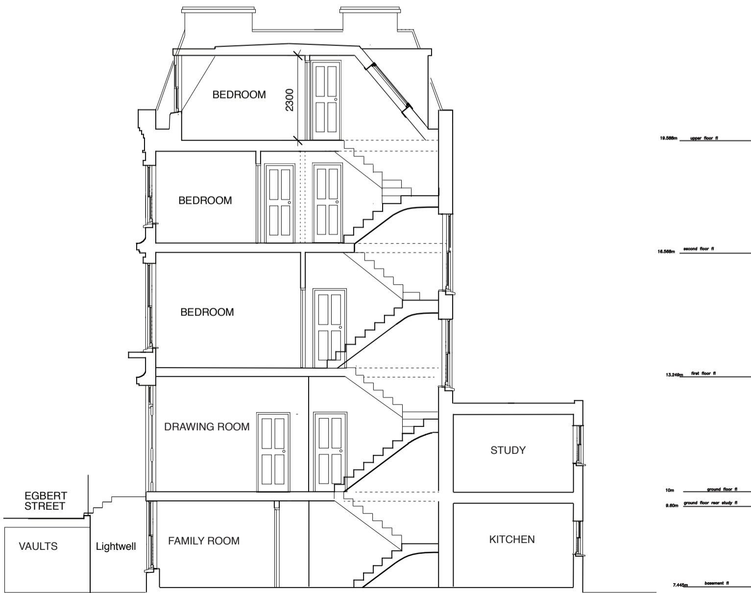
Existing Section Through Stairwell

PROPOSED EXTENSIONS & ALTERATIONS TO 10 EGBERT STREET LONDON NW1