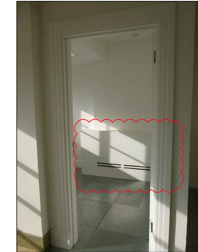
Proposal to RELOCATE EXISTING fan coil units