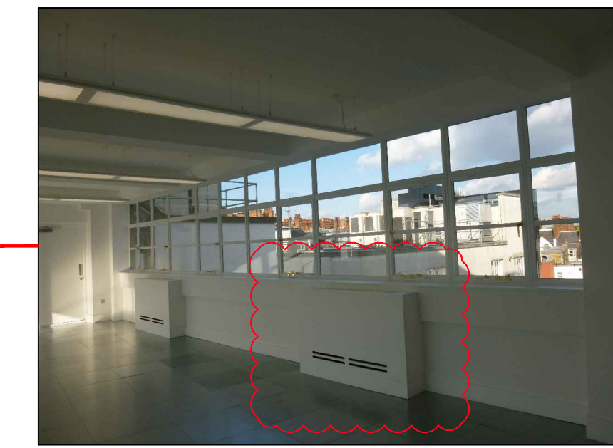
Proposal to RELOCATE EXISTING fan coil unit