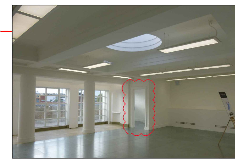
Proposal to BLOCK EXISTING Door