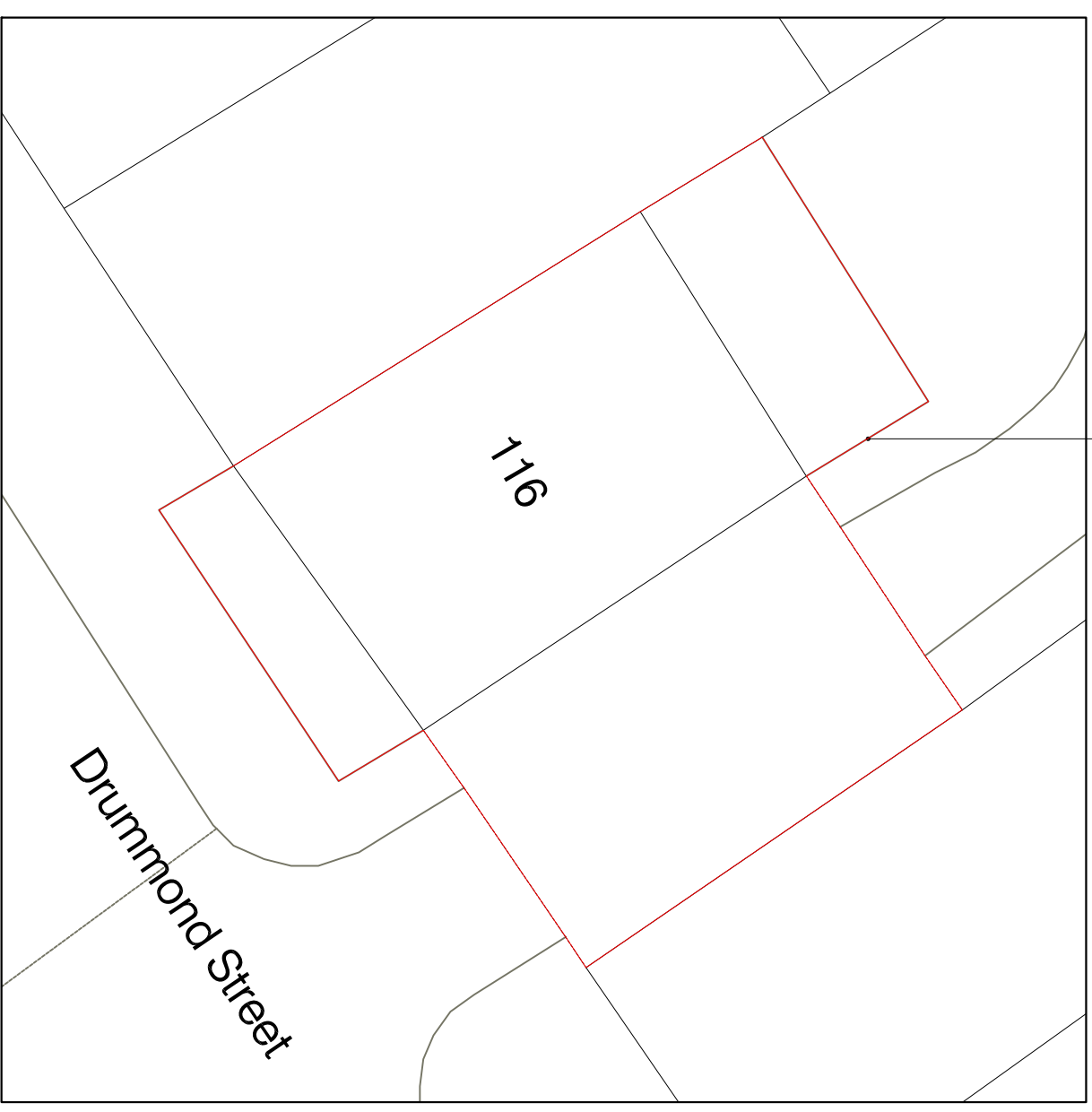
02 EXISTING SITE PLAN scale 1:500