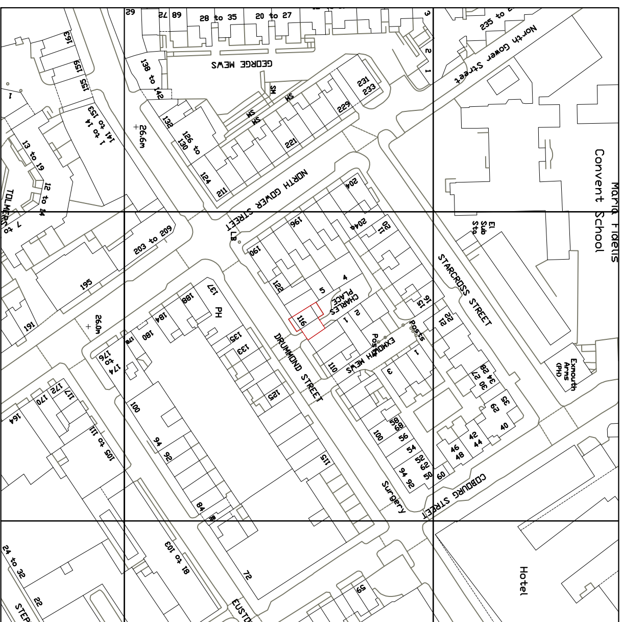
01 EXISTING LOCATION PLAN scale 1:1250