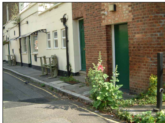
EXISTING WHITE RENDERED WALLS WITH COPING DETAIL TO BE RETAINED