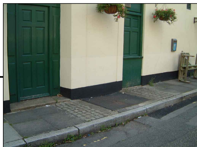
EXISTING DOOR OPENINGS TO BE RETAINED