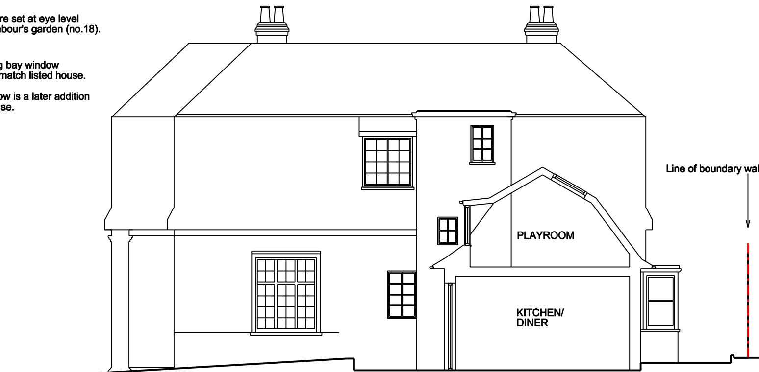
PROPOSED SECTION CC

- DIMENSIONS ARE NOT TO BE SCALED FROM THIS DRAWING. - ALL DIMENSIONS SHOWN ARE FOR INFORMATION ONLY. - THE CONTRACTOR IS RESPONSIBLE FOR CHECKING DIMENSIONS, TOLERANCES AND REFERENCES. VERIFY ANY DISCREPANCIES WITH THE ARCHITECT BEFORE PROCEEDING WITH THE WORKS. - PROPOSED LAYOUT SUBJECT TO SITE INSPECTION AND VERIFICATION OF BUILDING REGULATION REQUIREMENTS. THIS DRAWING IS COPYRIGHT