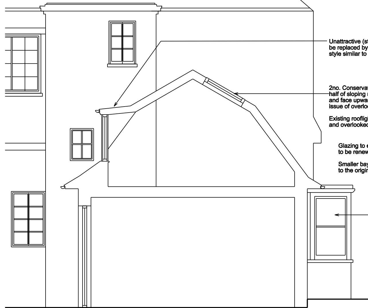
PROPOSED SECTION CC

Unattractive (standard) existing rooflights to be replaced by more attractive windows in style similar to windows on the Listed House