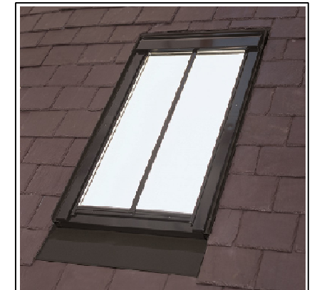
Example of proposed conservation rooflights