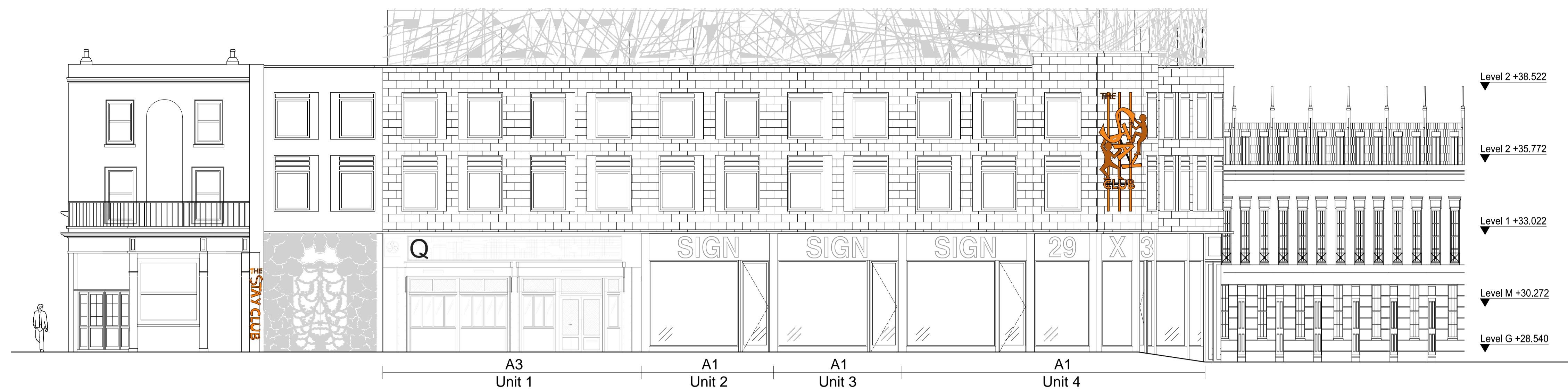
E1 - CHALK FARM ROAD ELEVATION scale 1:100