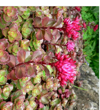
Sedum spurium Purpureppich