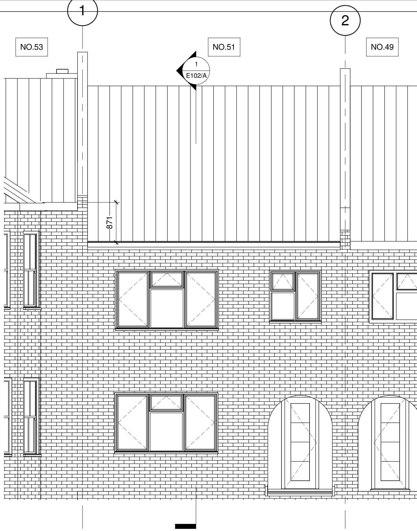
FRONT ELEVATION EXISTING

DO NOT SCALE. ALL FIGURED DIMENSIONS TO BE CHECKED ON SITE PRIOR TO CONSTRUCTION. ALL COPYRIGHT RESERVED