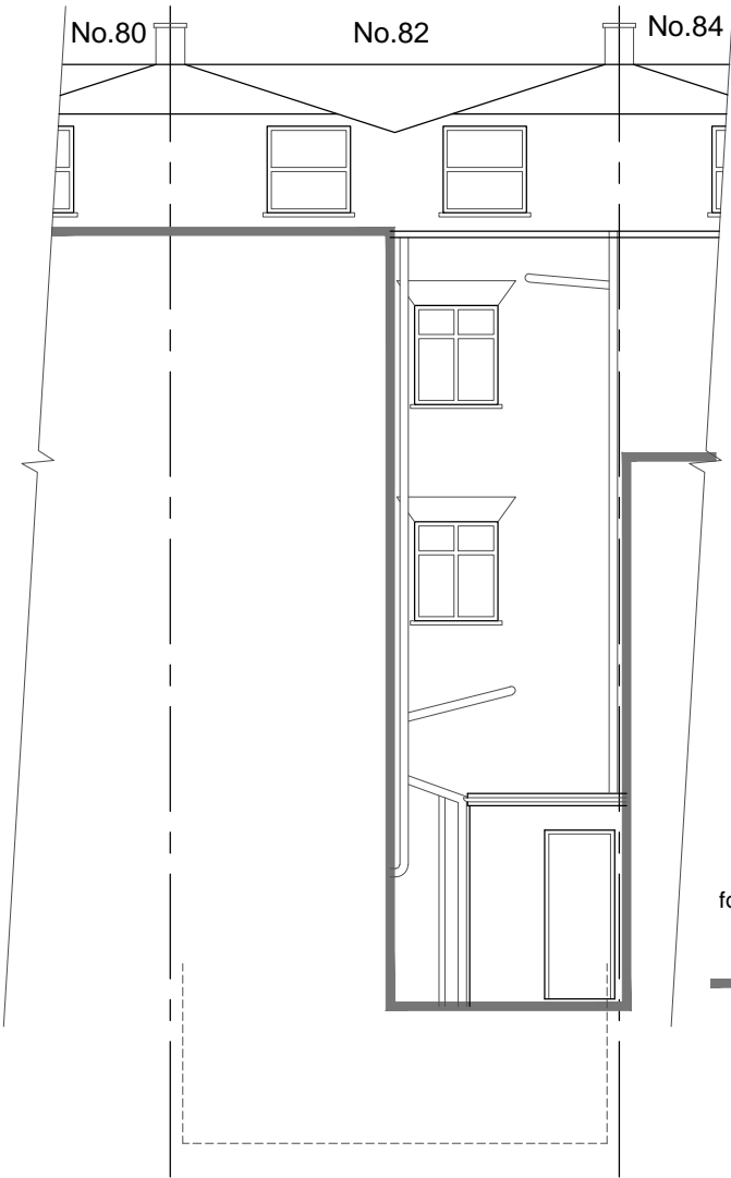
NORTH-EAST (REAR) ELEVATION