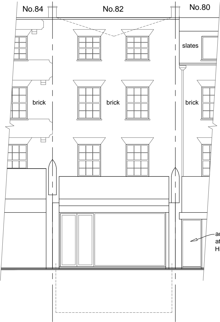
SOUTH-WEST (FRONT) ELEVATION