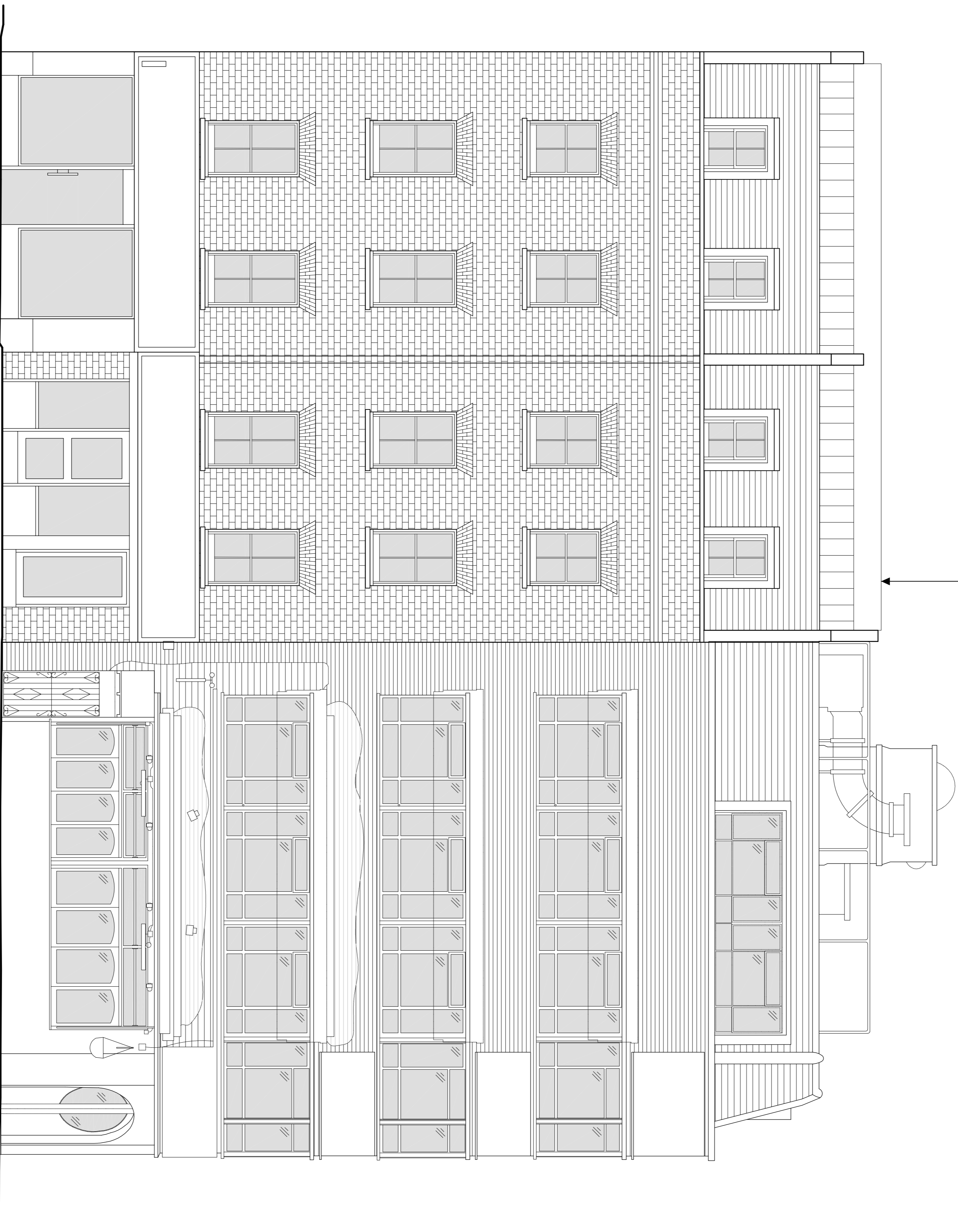
Goodge Street Elevation

Proposed Building approved, under planning permission ref: 2013/6456/P currently under construction