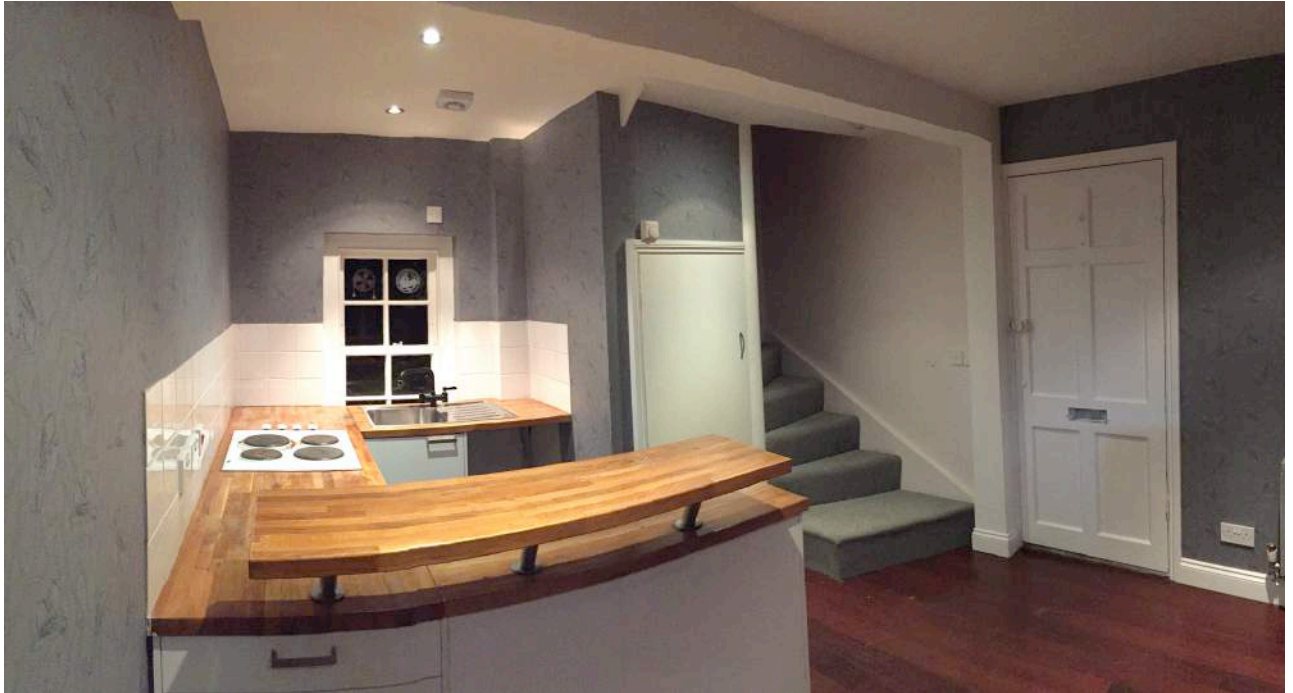
Extension: Kitchen/ Dining/ Living Room