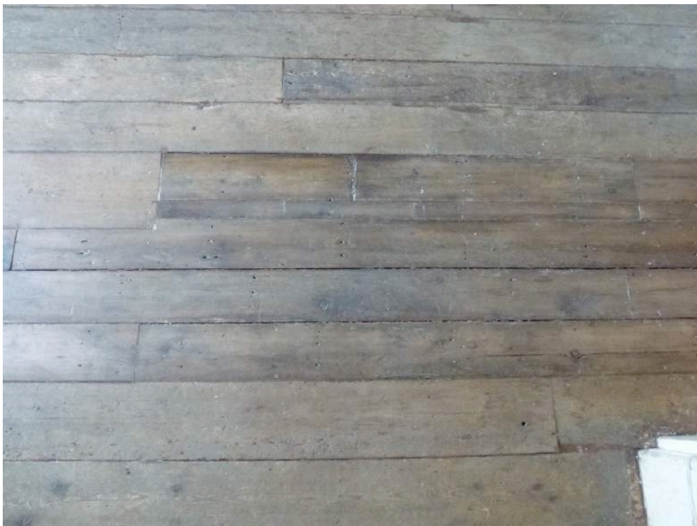
Dining Room Floor