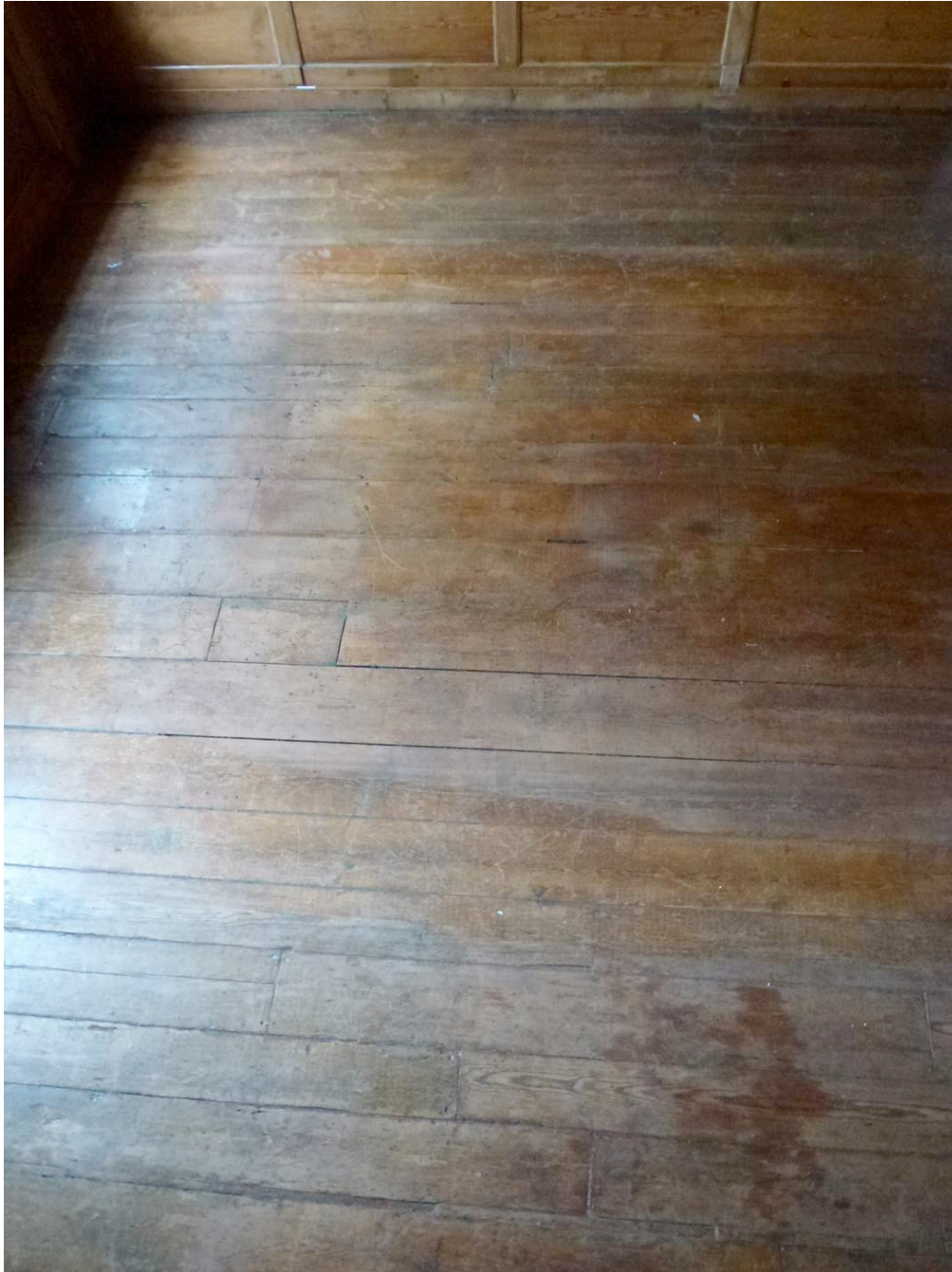
Front Reception Floor