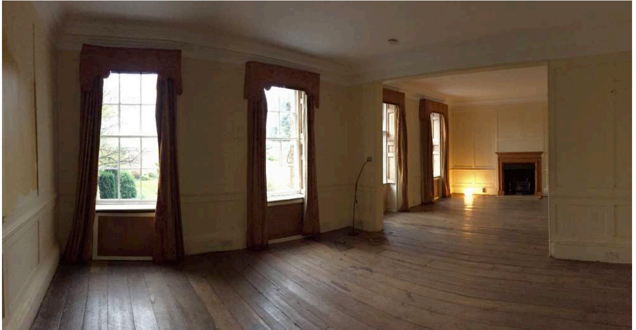
Living/ Dining Room