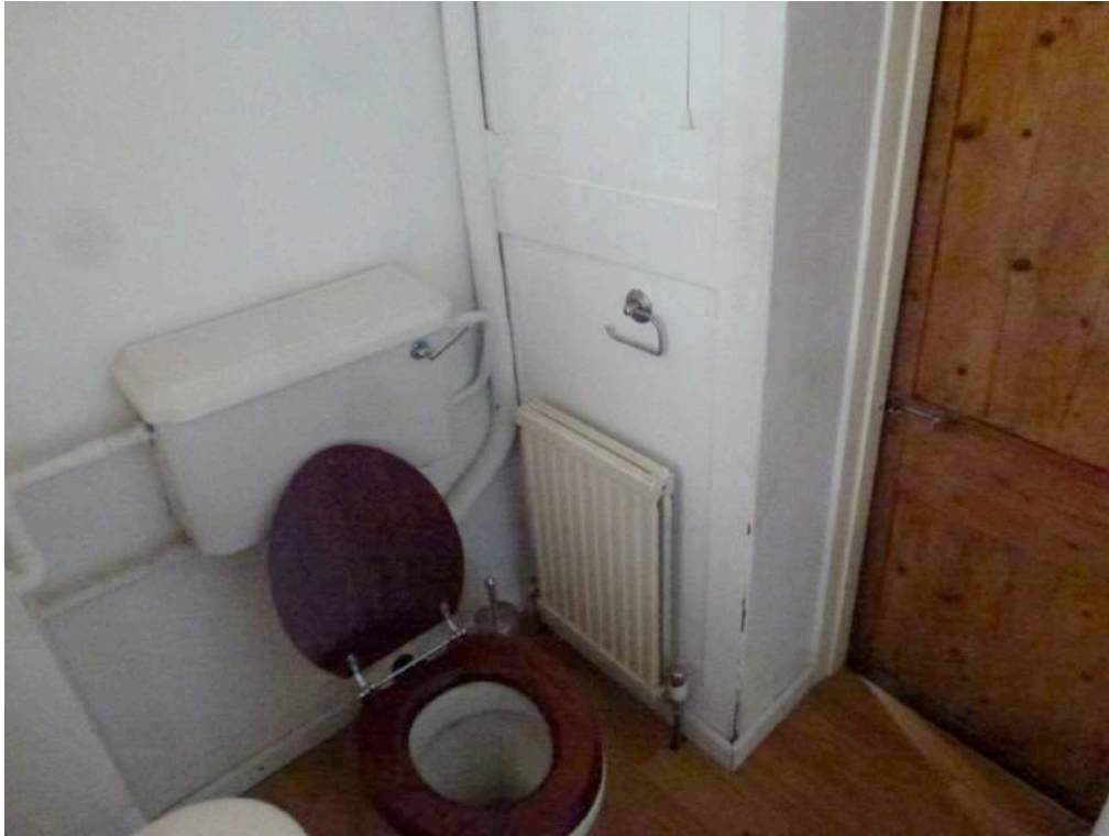
Guest WC adjacent to Entrance Hall