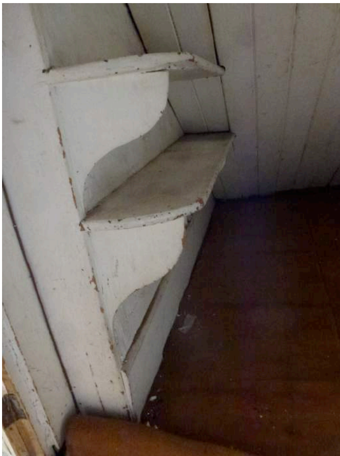
Understairs Store adjacent to Entrance Hall