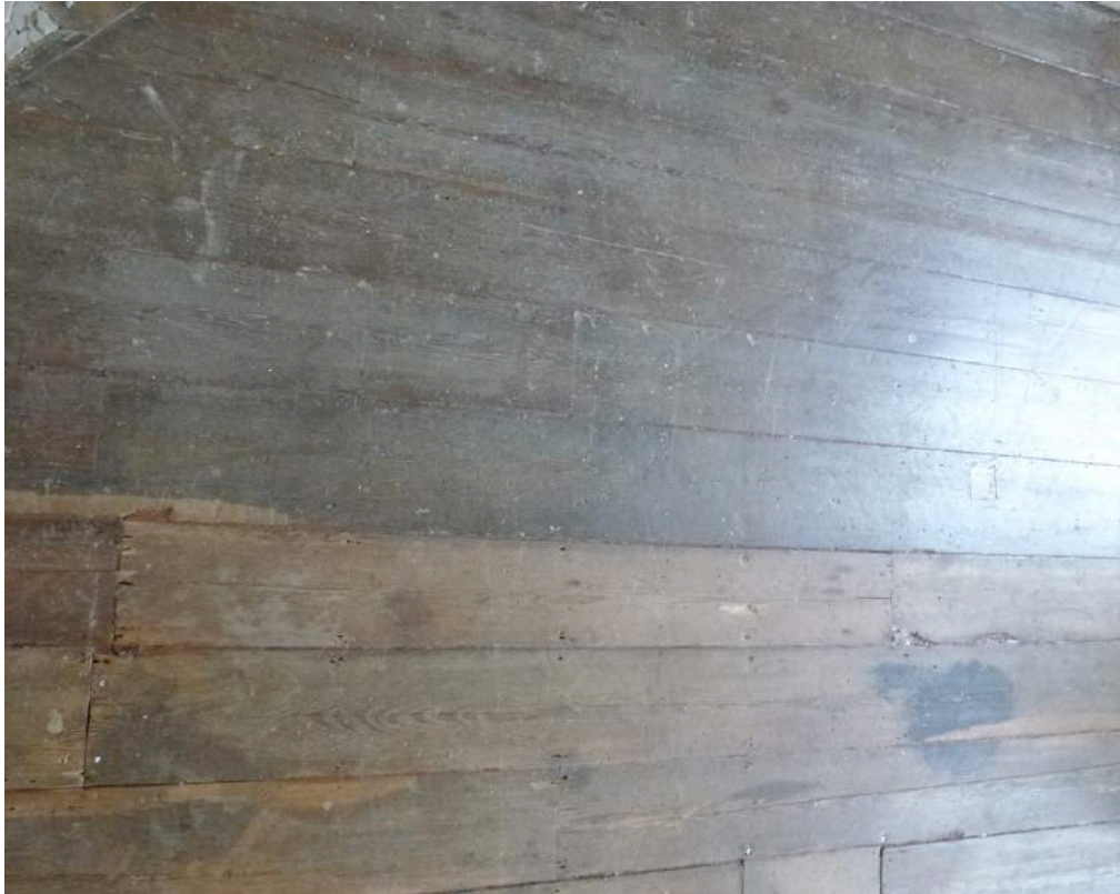
Living Room Floor