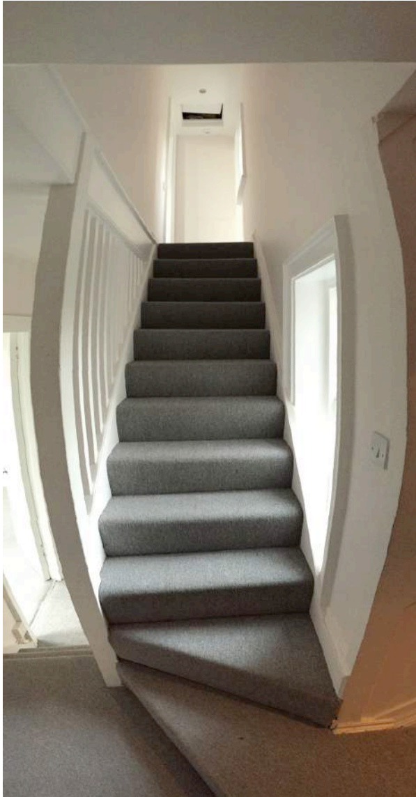
Extension: Back Stairs and Landing