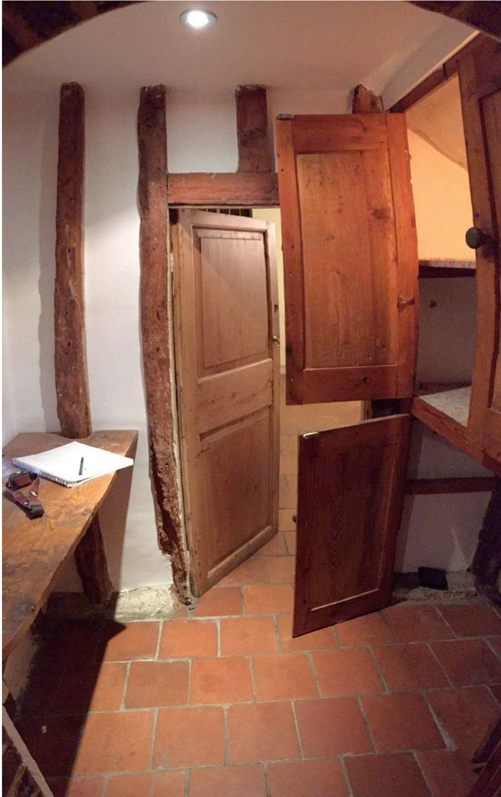
Store between Kitchen and Play Room