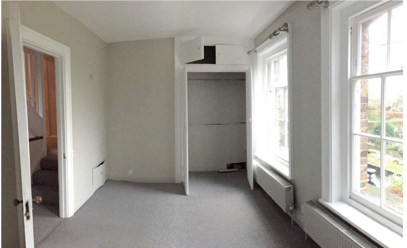
Extension: Bedroom 7