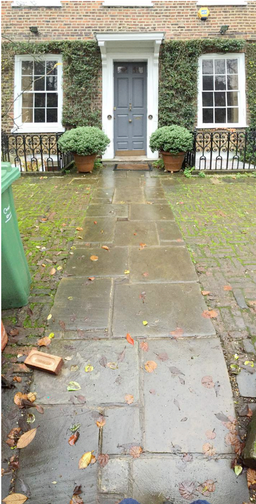
York stone path and brick paving to front garden