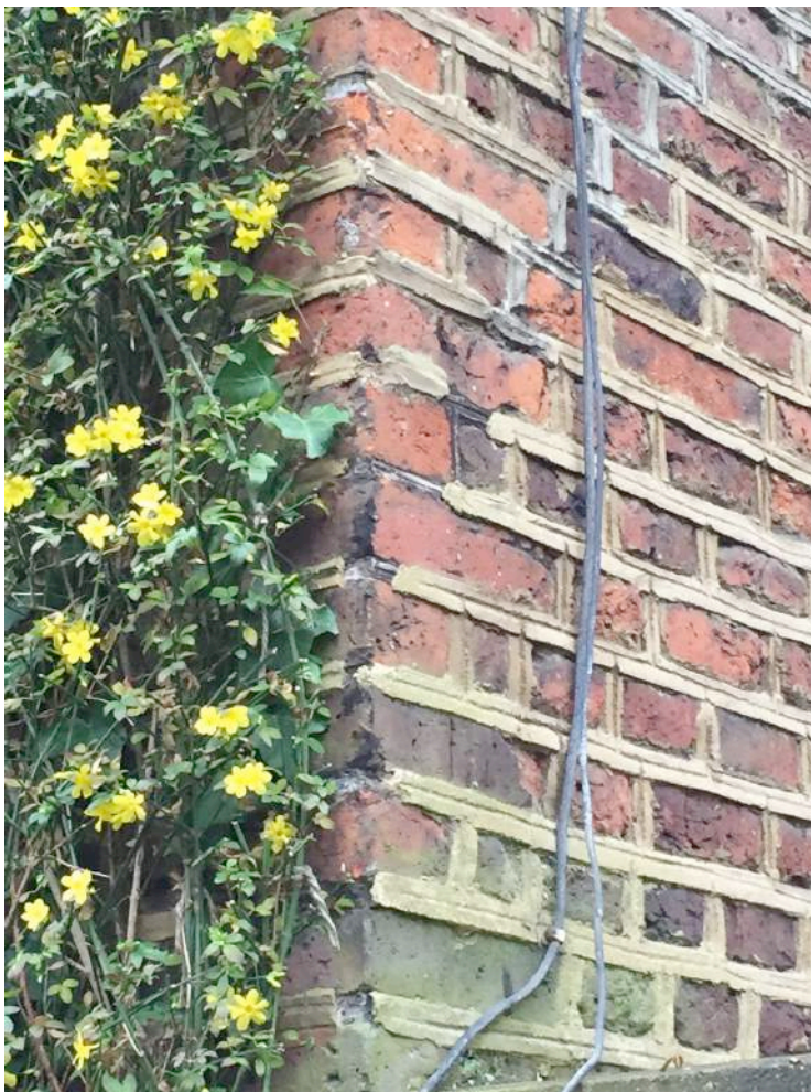
Brickwork/ pointing at corner of front elevation and flank elevation of Main House