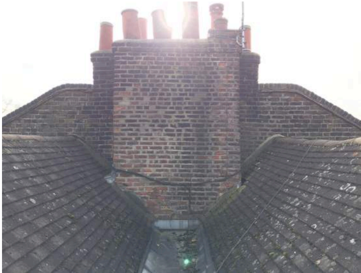
Chimney stack on party wall with No. 3 The Grove