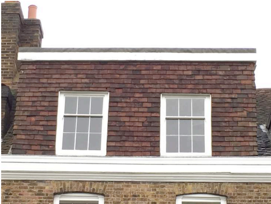
Large dormer to rear elevation of Main House