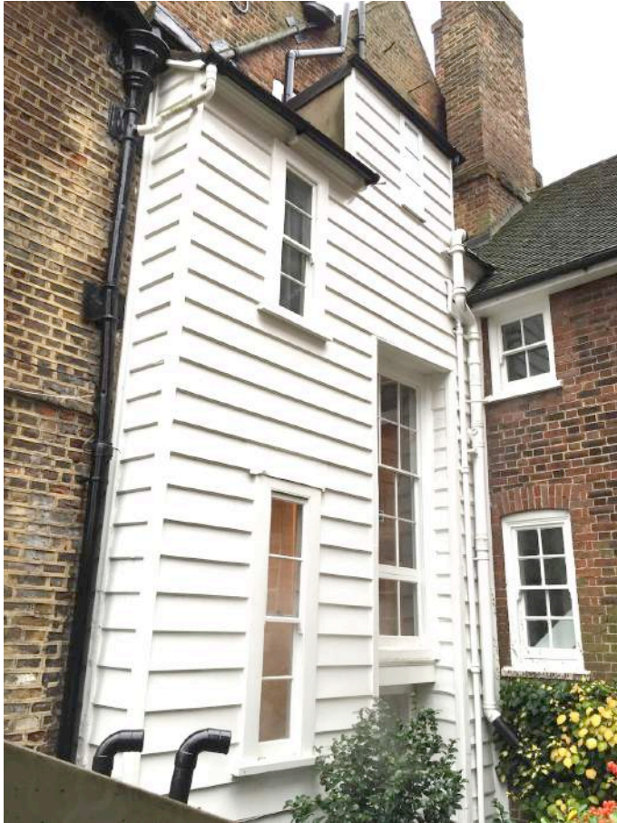
Clapboard Side Extension