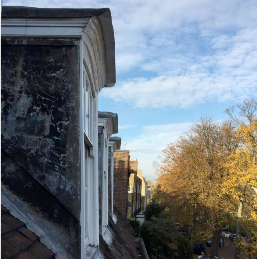
Front Elevation Dormers