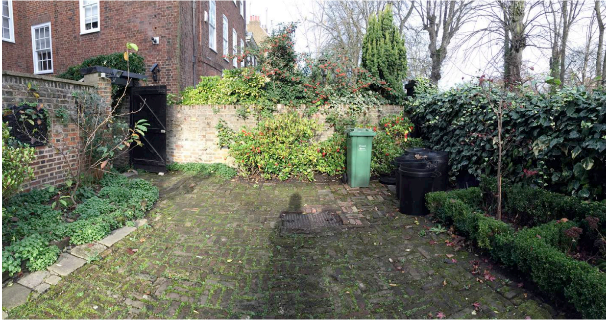
Brick paving & Boundary walls to front garden