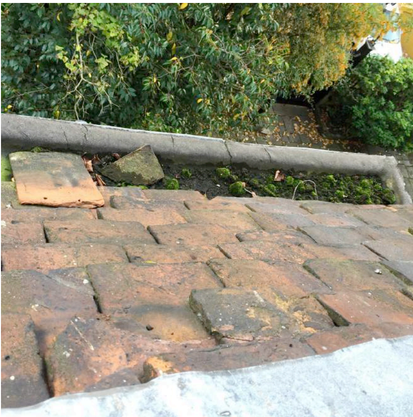
Front pitch to Main House roof