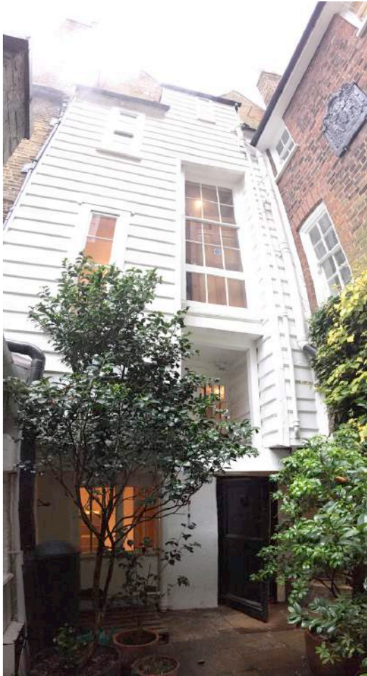
Clapboard Side Extension