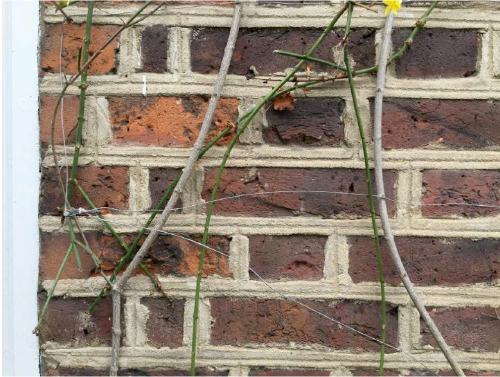
Brickwork/ pointing on front elevation of Main House