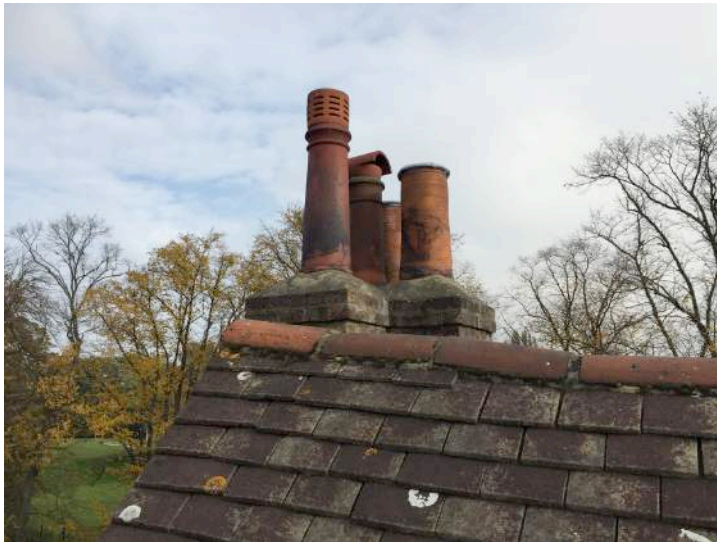
Front chimney stack on flank elevation