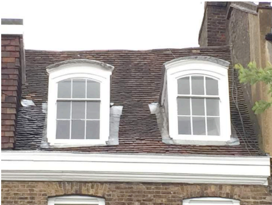
Small dormers to rear elevation of Main House