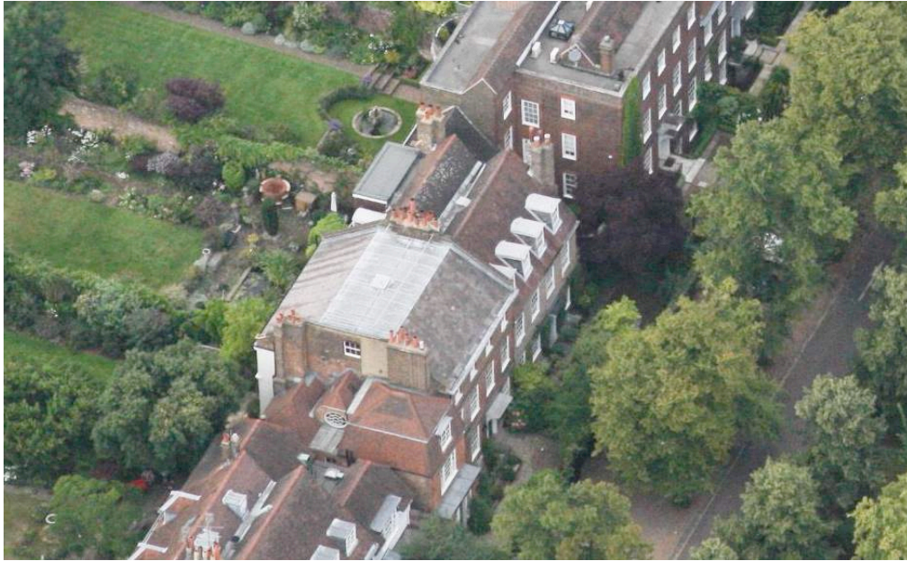
Aerial view from South