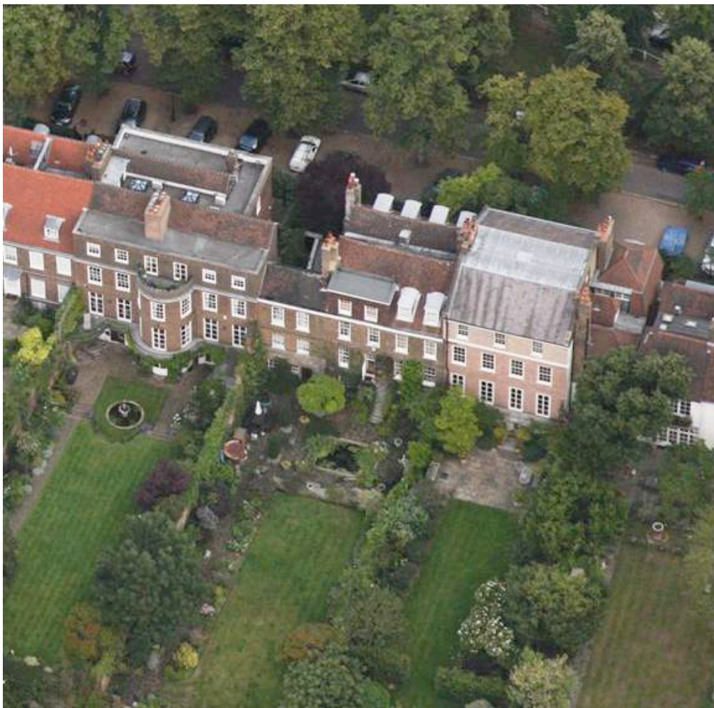
Aerial view from West