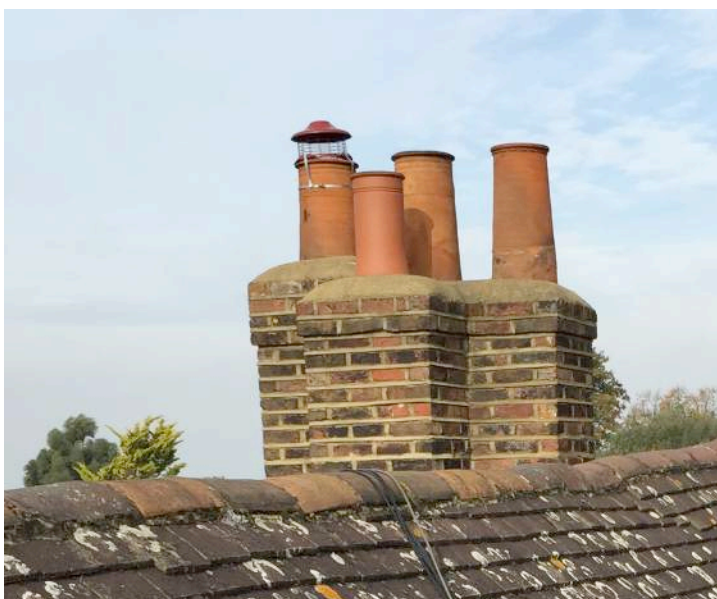
Rear chimney stack on flank elevation