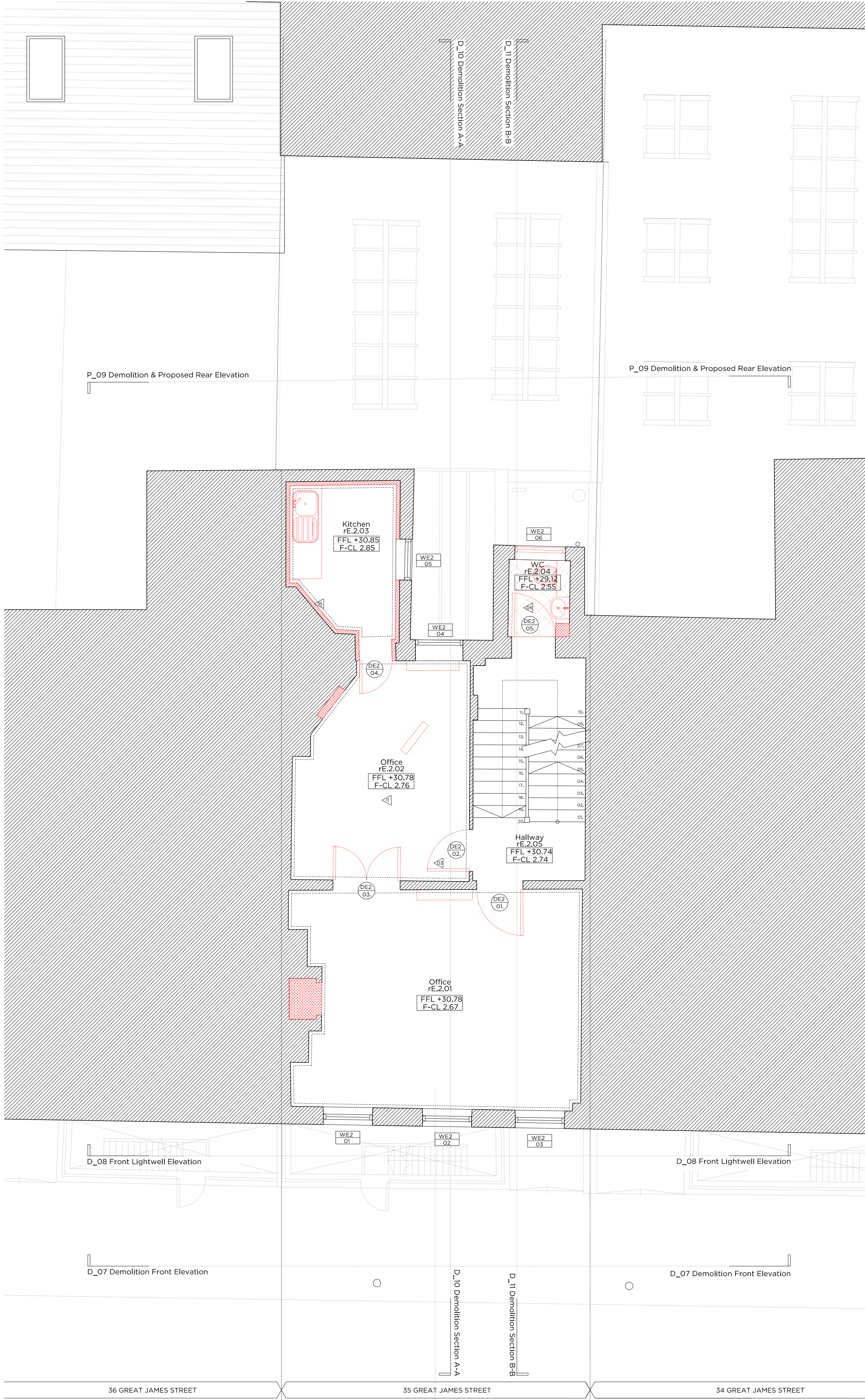
Demolition Second Floor Plan