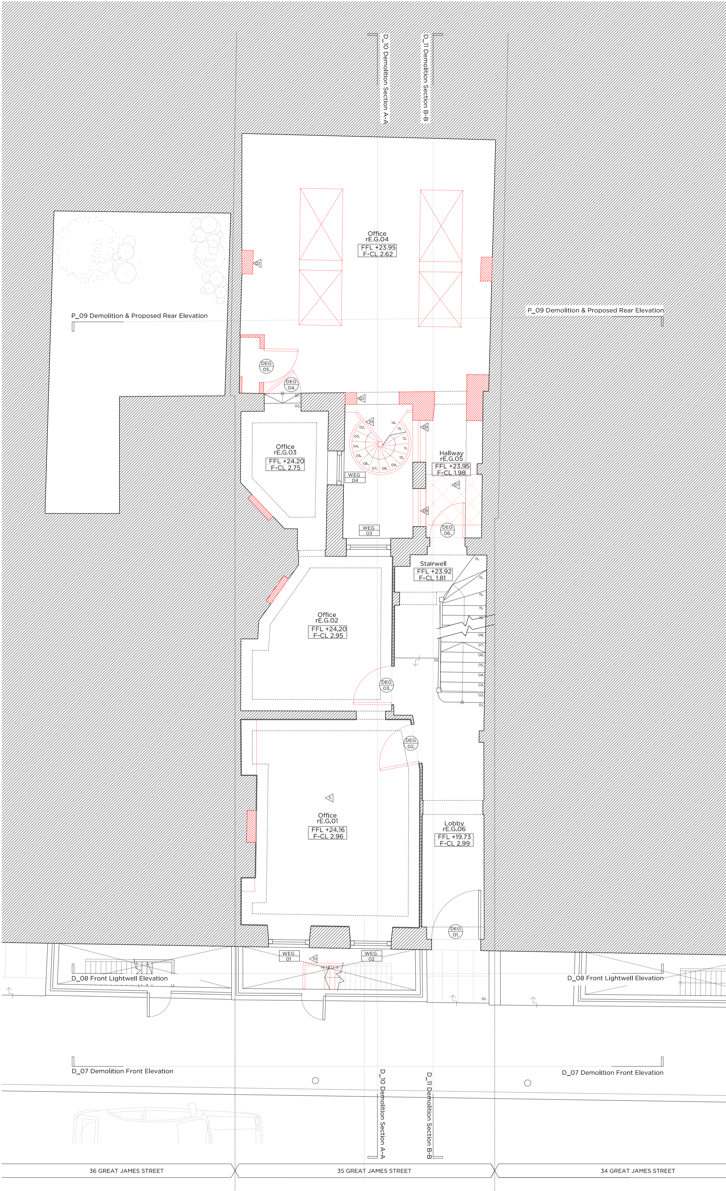
Demolition Ground Floor Plan