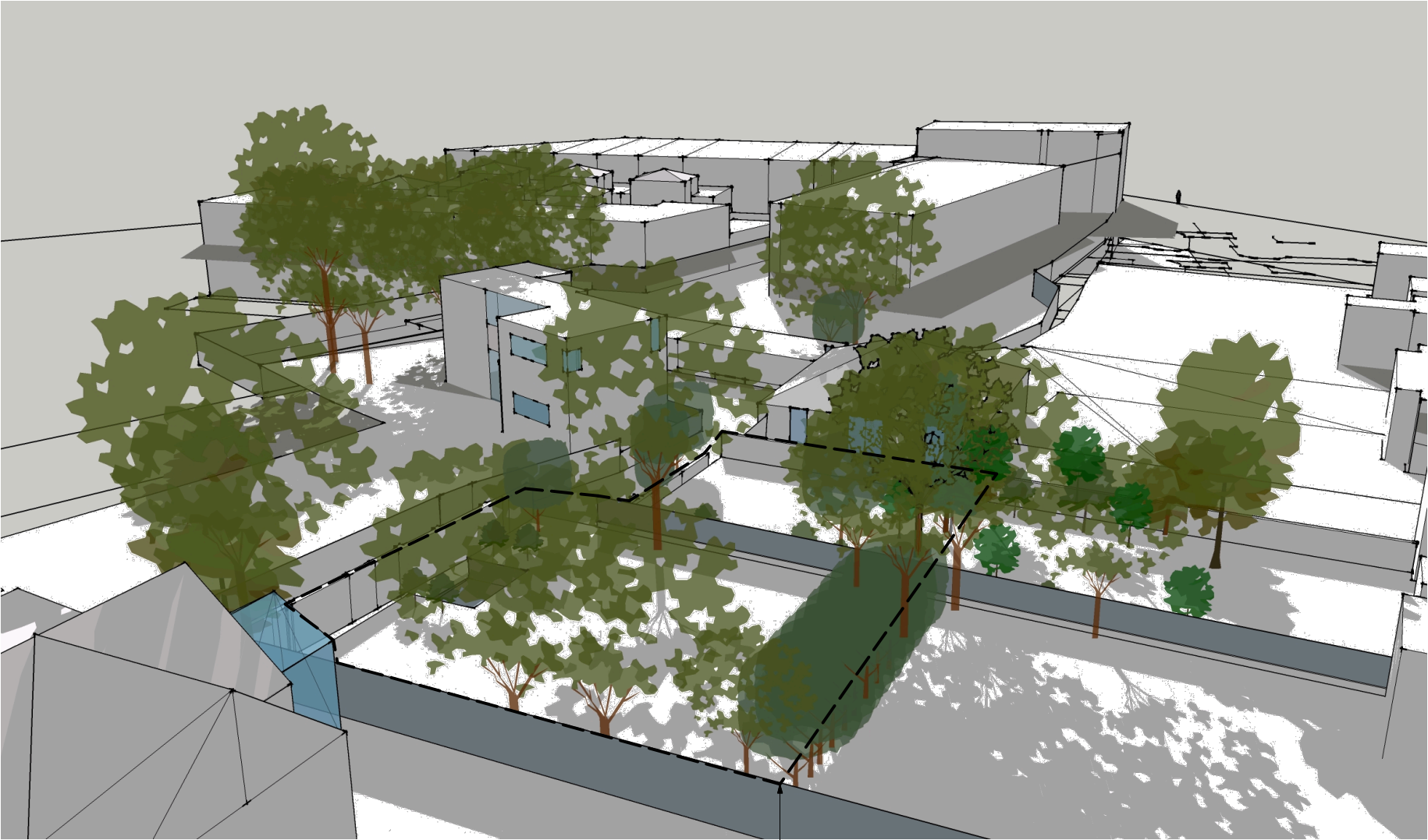
3D Visual of Application site , looking south west.