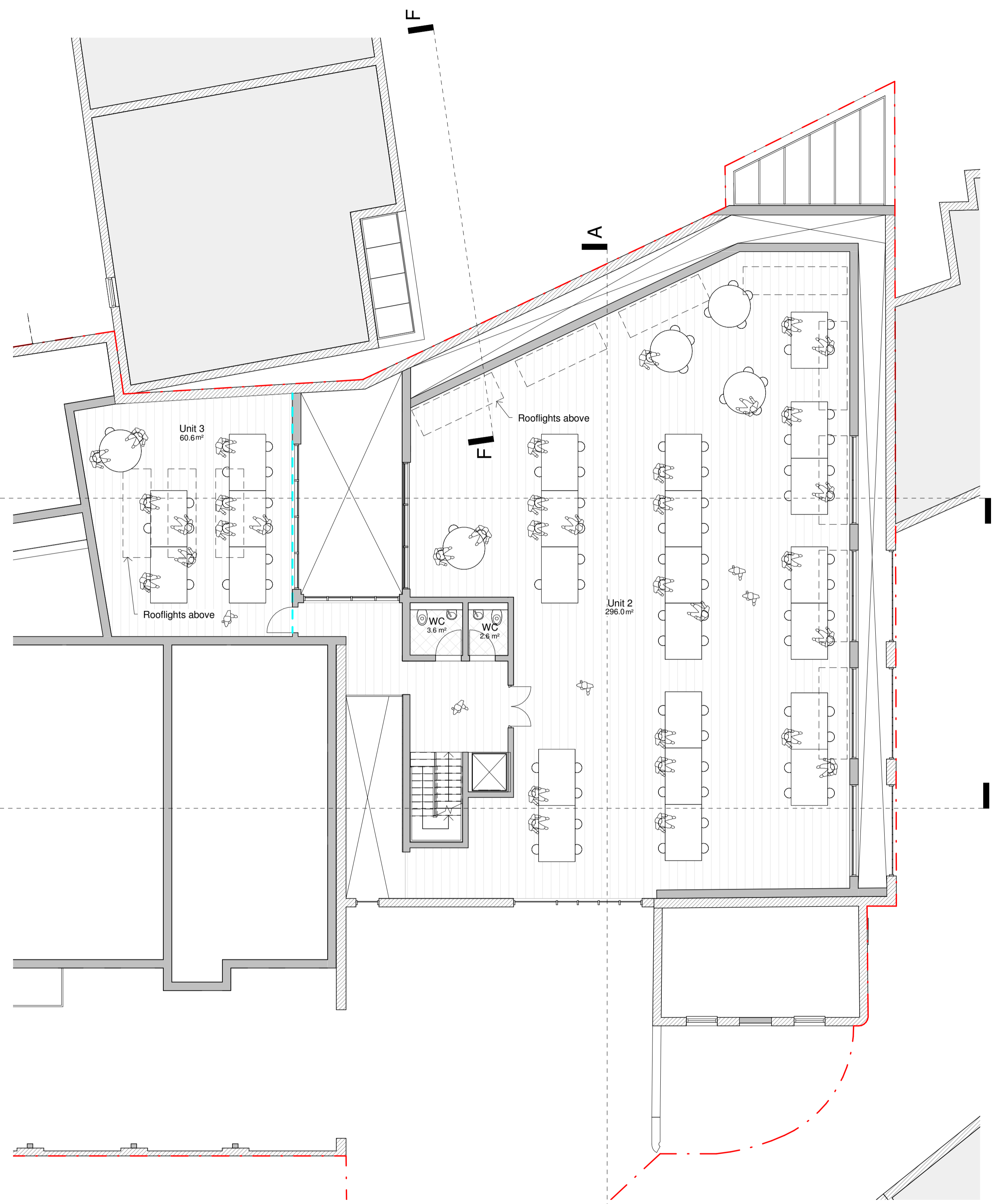
1 Commercial - Level 1 1 : 100